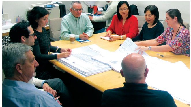
Splunk, Inc. STI meeting.

PRELIMINARY DESIGN REVIEW ASSISTANCE Upon request, we provide preliminary review meetings for design consultants to discuss code and process issues specific to your project.