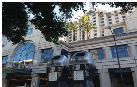
Smart Meters in the Downtown Core

In addition to the PMP, this CIP was developed with guidance from the Envision San José 2040 General Plan, particularly to provide a well-maintained parking infrastructure with the goal of supporting Downtown as a regional job, entertainment, and cultural destination. The 2015-2019 CIP focuses on projects that will adequately maintain the City’s parking facilities in a safe and operational manner, improve garage signage and façades to attract new parking activity, support security program upgrades, and provide for multi-modal improvement projects in the Diridon Area.