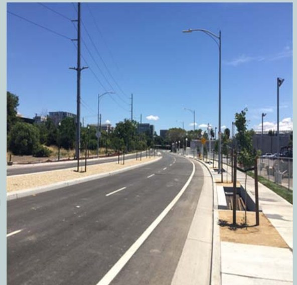
Photo of Autumn Parkway facing south towards the Julian Street

Bottom (after) photo: Newly installed sidewalk along N. Almaden Blvd/ St. John Street