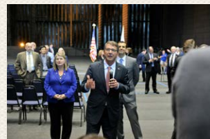
U.S. Defense Secretary Ashton Carter announcing FlexTech Alliance won a $75 million Department of Defense award.