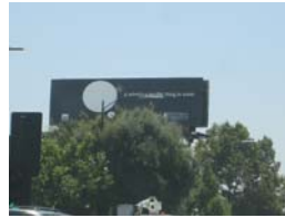
Message Category: Public Service Condition: Good