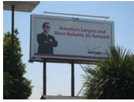
Message Category: Other Condition: Good