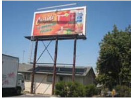
Message Category: Alcohol Condition: Good