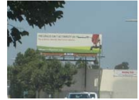
Message Category: Public Service Condition: Good