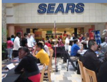
Youth Job Fair