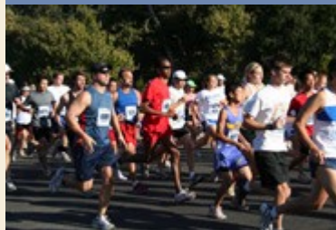
Almaden Times Classic race