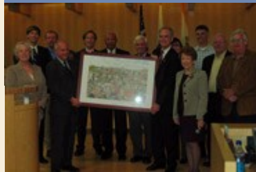
Gift from Dublin Sister City Program