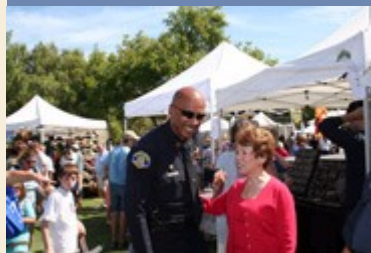
Almaden Art and Wine Festival