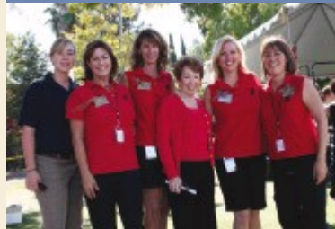
Almaden Art & Wine Festival