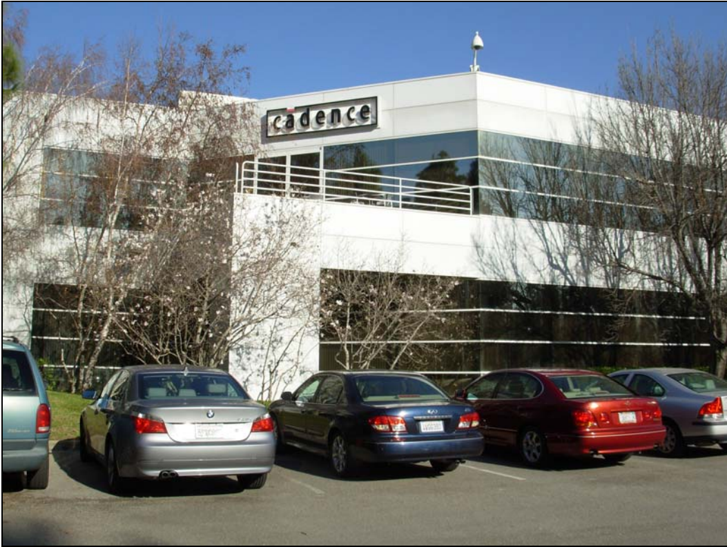
Photo 3 – View the building located on the southeast corner of the site (575 River Oaks Parkway) looking northeast.