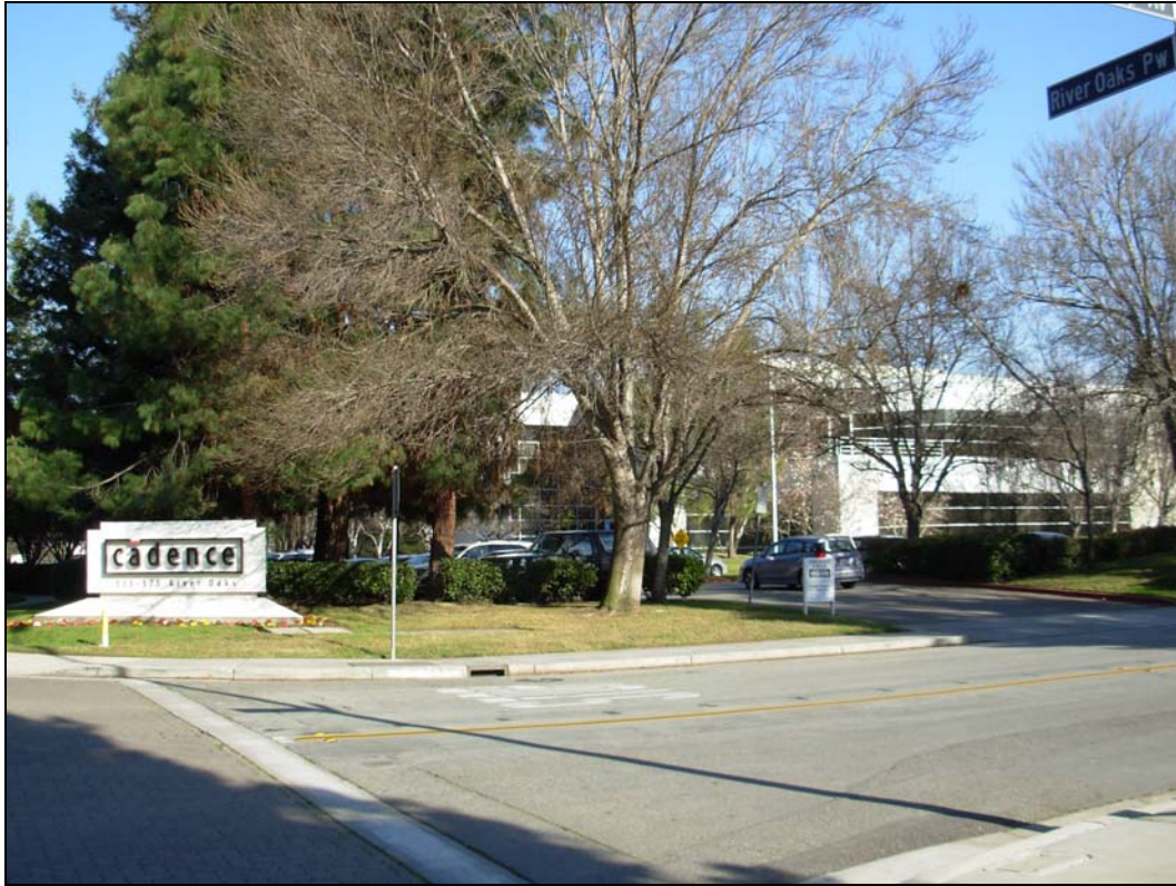
Photo 1 – View of project site from Seely Avenue looking northeast.