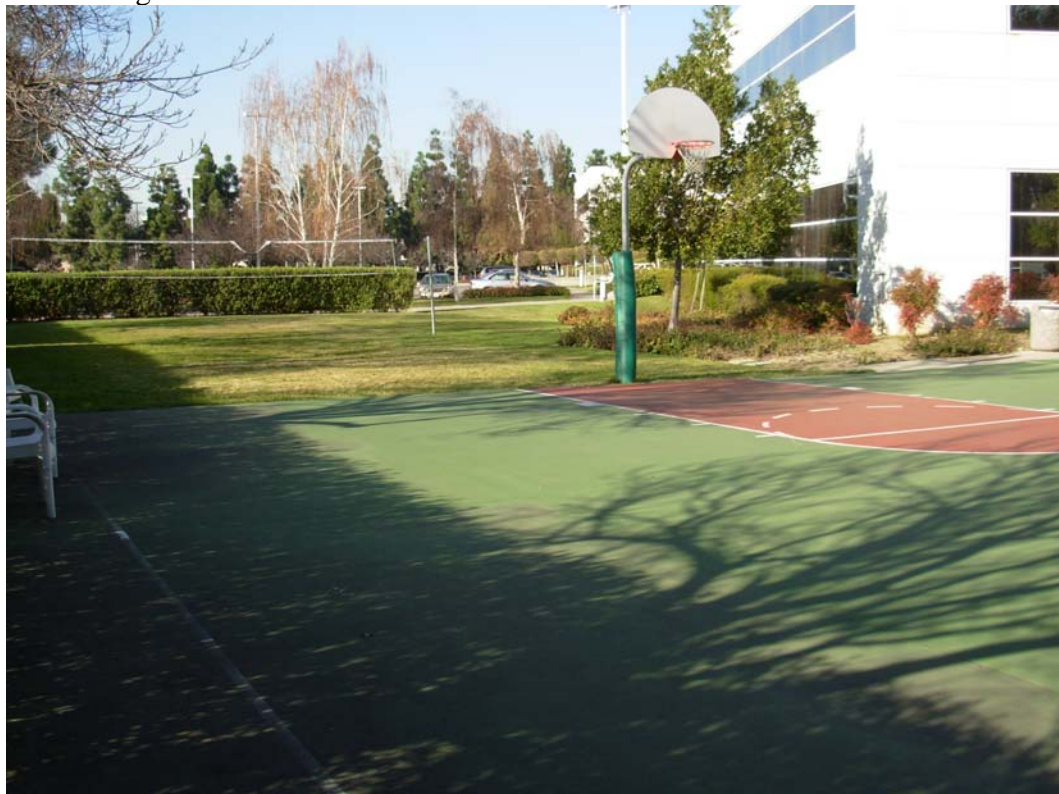
Photo 6 – View of basketball half-court and volleyball grass court located to the southwest of southern most building (575 River Oaks Parkway) looking northwest.