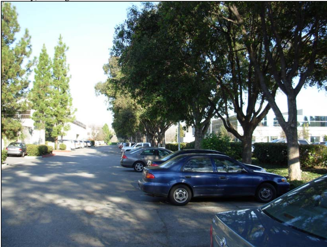
Photo 4 – View of project site and southeastern boundary looking northeast. Adjacent light industrial building is shown on the right side of the photo in the background.