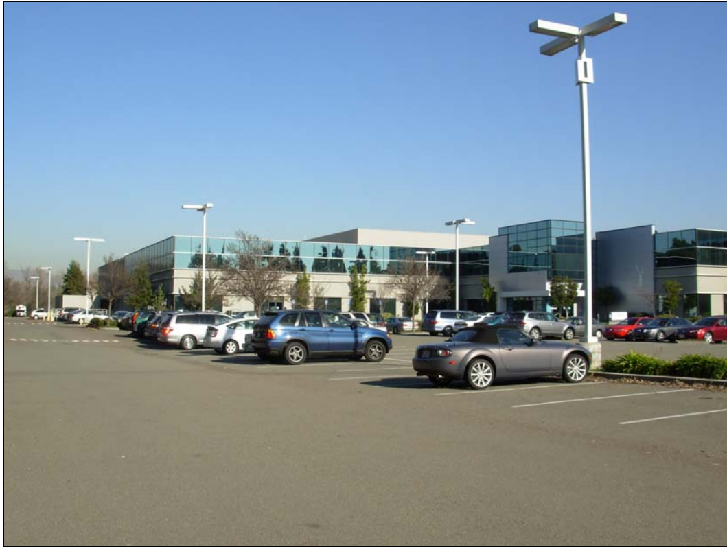
Photo 5 – View of adjacent light industrial building located southeast of the project site looking northeast.