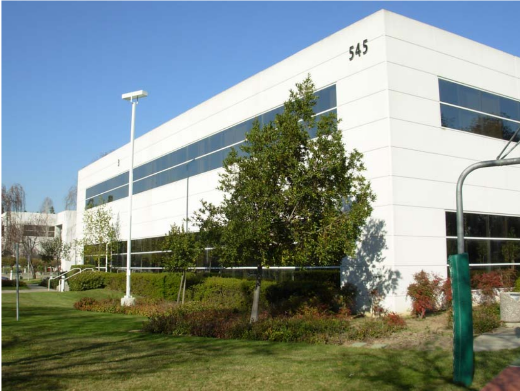
Photo 7 – View of northernmost building on-site (545 River Oaks Parkway) looking north.