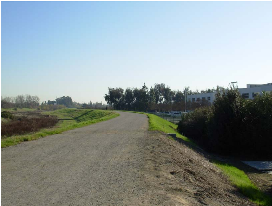
Photo 8 – View of Coyote Creek trail located to the northeast of the project site. The project site is visible in the background on the right side of the photo.