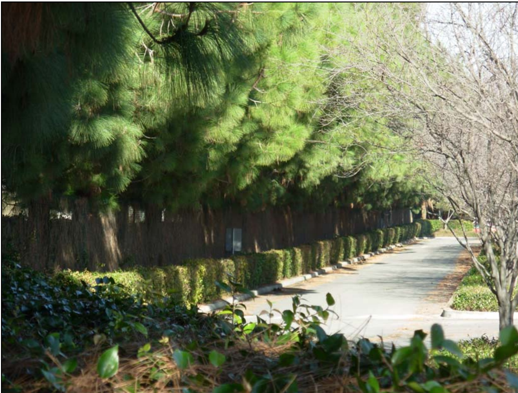
Photo 2 – View of project site's northwestern boundary looking northeast.