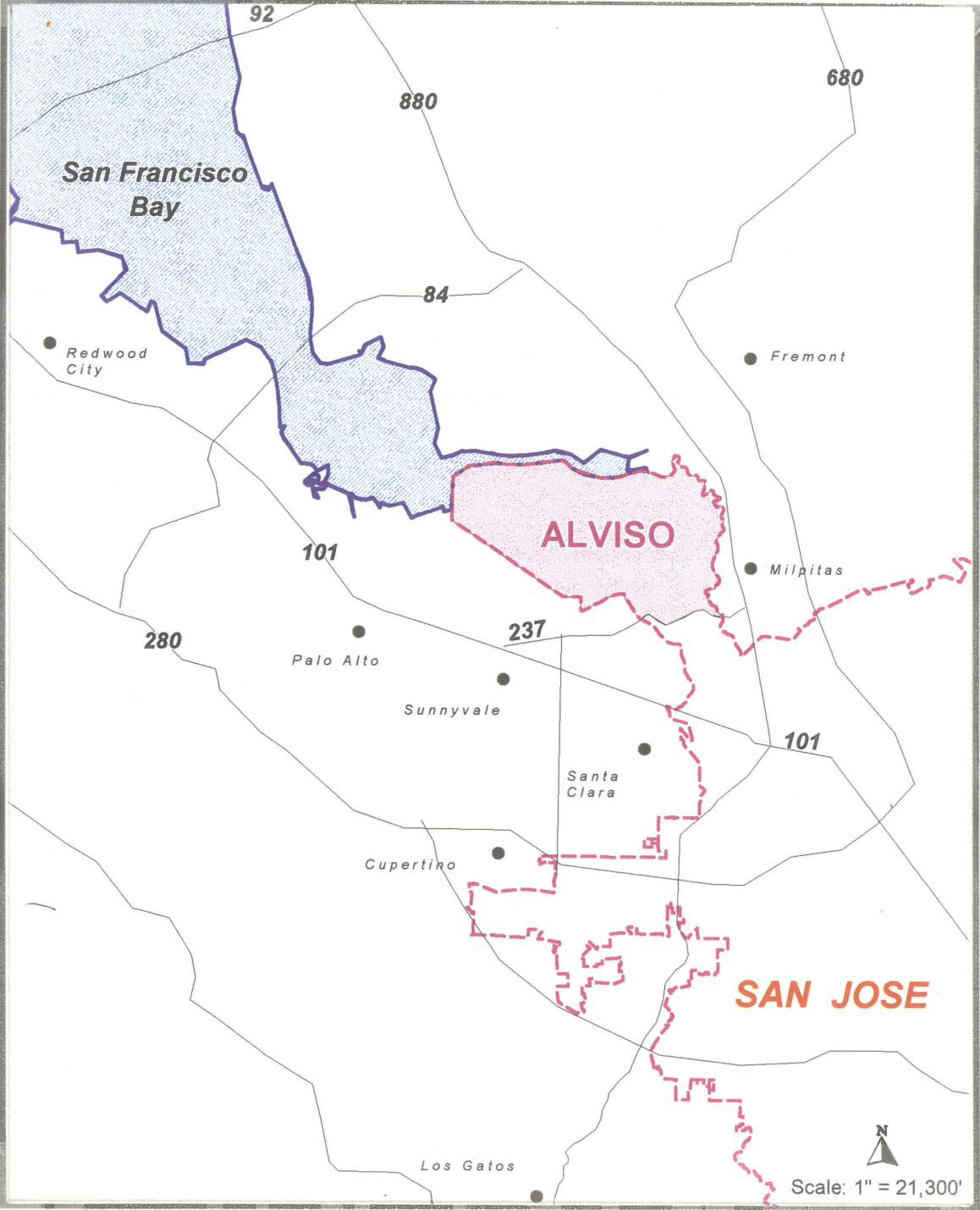
FIGURE 1. Regional Context