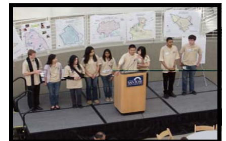
San José Youth Commission at last year's "Beat the Statistics Youth Conference."

1st & 3rd Wednesday of month 6-8pm Almaden Community Center