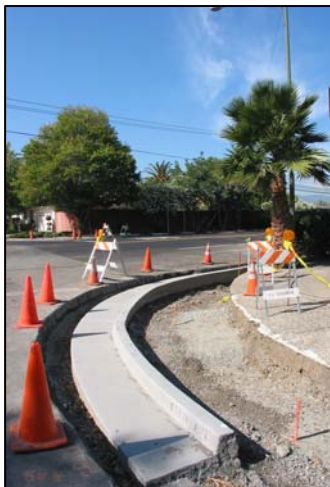
Photographs of general street construction operations

Schedule: Start of Construction April 2011 Anticipated Completion October 2011