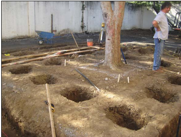
Project photo (left) shows the subgrade for the new recycled plastic Trex® deck that will be installed around an existing elm tree.

Schedule: Bid Opening: August 19, 2010 Contract Award: September 24, 2010 Construction Start: November 8, 2010 Anticipated Completion: May 2011