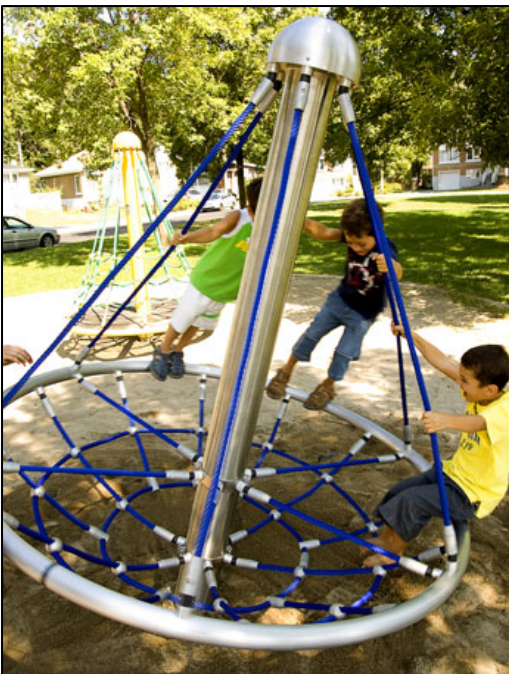
Future Paul Moore Youth Lot ( below )

Schedule: The project is approaching design completion and is pending further study of the resilient rubber tiles proposed for the play area surfacing.