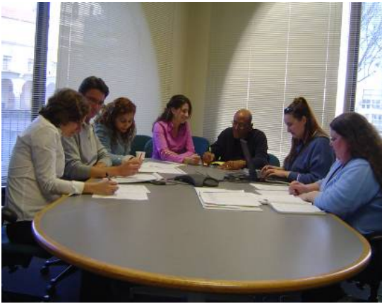
Urban Runoff staff evaluating the Municipal Regional Permit Tentative Order.

The City's current NPDES permit was adopted in February 2001 for a five-year period. The permit was amended in October 2001 and July 2005, with both amendments relating to the New and Redevelopment stormwater treatment and hydromodification provision, also known as Provision C.3. The permit has been administratively extended since February 2006, pending the adoption of the Bay Area-wide Municipal Regional Permit.