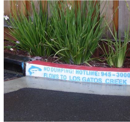
Storm drain inlet stenciled with hotline number and name of local creek

The City's Environmental Inspectors assigned within the Environmental Services Department (ESD) Watershed Protection Division respond to complaints regarding illegal discharges or threats of discharge to the storm sewer system. Residential incidents are typically the most frequent type of complaint, with vehicle-related sources being most common. Dumping of various materials is also a prevailing source of incidents. ESD responds to all complaints with education and enforcement in partnership to achieve compliance and prevent future incidents. This program element is implemented pursuant to permit provision C.2 and C.6.a.ii.