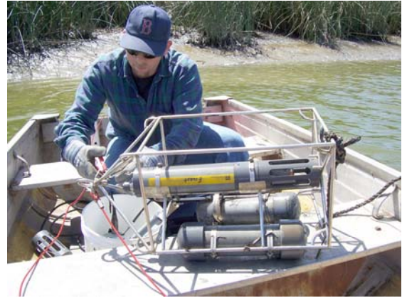
ESD Biologist collecting field data from Coyote Creek

Monitoring activities required in the stormwater permit are generally implemented in collaboration with other agencies. The City continues to participate in monitoring activities area-wide, including Regional and Program-focused investigation of pollutants and sources of pollutants to the storm drain system. The City also provides input and support to the Program's multi-year monitoring program, and reviews work products as various Program-level projects are designed and completed.