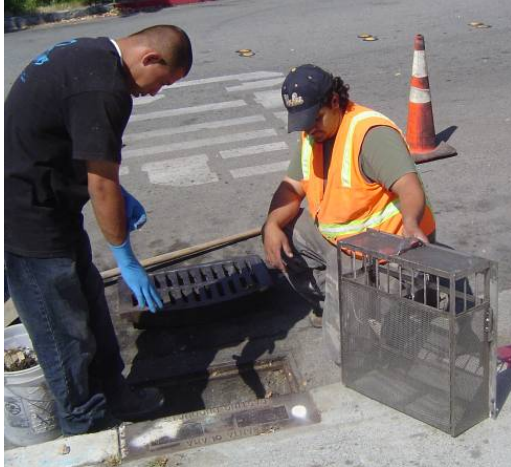
Installation of a catch basin screen on Mt. Vista Drive for the structural trash pilot

The purpose of the Trash program is to address litter and illegal dumping that threatens to pollute urban waterways. The impetus for this program was the 2001 Water Board Staff Report recommending that all urban creeks, lakes, and shorelines be placed on a monitoring list due to the threat of trash impairment to water quality. The City's activities focus on assistance with the development and implementation of an effective trash strategy, ongoing trash evaluations in high priority areas, implementation or refinement of trash management practices, and piloting the use of structural controls for trash. This program element is implemented pursuant to the Program's Trash Work Plan and provision C.1 of the permit.