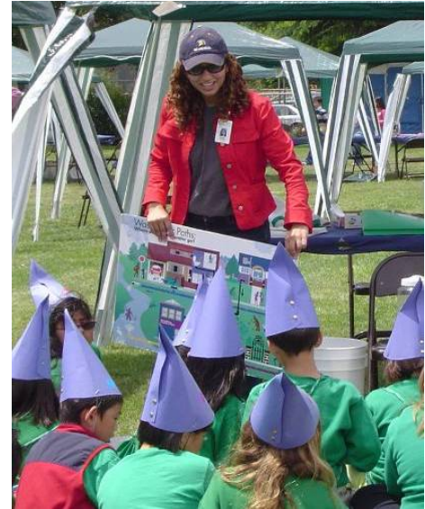
Watershed Protection Engineer educating 3 rd graders at the Water Wizards Festival

This program is implemented in accordance with provision C.4 and includes general outreach, targeted outreach, educational programs, and public participation activities. The City has a robust and broad-based public information and public participation program, utilizing many different outreach methods to best deliver stormwater pollution prevention and watershed protection messages. Conducting outreach to the community and providing opportunities for participation in water quality protection activities are critical to evoking the behavior changes needed to manage stormwater quality. They are also important for garnering the support needed to continue and expand services and programs. Examples of outreach activities include: stenciling of storm drain inlets throughout the City, training sessions for staff and developers about stormwater runoff construction requirements, and conducting Wacky Watershed teacher training workshops.