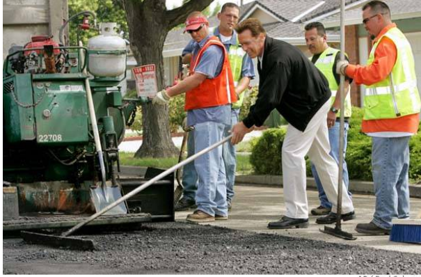
DOT paving crew receives a hand from the governor

This program element is one of several that address municipal activities. The PSR program element consists of incorporating best management practices (BMPs) into City operations such as street repair. Training plays a key role in ensuring that staff uses the proper techniques during the course of their duties to protect water quality. Training topics and activities include spill response, resurfacing, sealing and patching, saw-cutting, street sweeping, landscape chemical application, concrete installation, pavement striping, legend removal, and catch basin inspection after