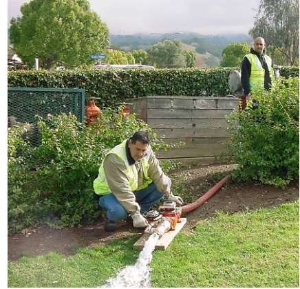
Water System Technicians diverting flow to landscape area during maintenance

This program element addresses a municipal activity and is implemented in accordance with provision C.2.a. The program addresses operation and maintenance activities at the City's Municipal Water system. The key tools for implementing this program are the Water Utility Pollution Prevention Plan and staff training to ensure that proper techniques are employed during maintenance activities. The City's training program includes the annual development of a video demonstrating the implementation of BMPs for a specific work function.