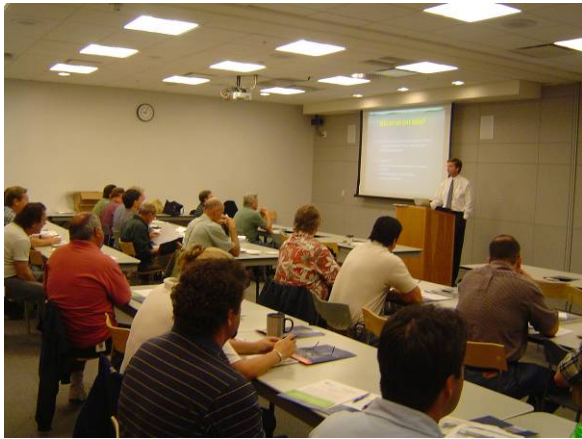
Annual training of City inspectors on construction site stormwater management

This program element summarizes the City’s efforts to train City staff on pollution prevention practices and to ensure that City facilities comply with stormwater requirements. Municipal training continues to be a key element for most program elements. Specific program elements that include municipal training activities include ICID 3, IND 5, NRD 11, CON 6, CON 8, PSR 2, PSR 3, PSR 6, SDO 3, SDO 4, PM 4, and WUO&M 3. In order to ensure that City facilities comply with stormwater requirements, Corporation Yards are routinely inspected by ESD staff and the results and improvements discussed with