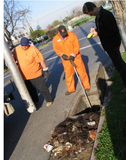
DOT Vector crew cleaning out a storm drain inlet while Urban Runoff staff collects GIS data

Storm Drain System Operation and Maintenance is another municipal activity program element implemented in accordance with provision C.2.a of the permit. This program includes key maintenance activities that are conducted to ensure the proper function of the storm sewer system to collect and convey storm runoff. The Department of Transportation Standard Operating Procedures for catch basin cleaning and Problem Area Reporting are a focus of crew training. A GIS map overlay has been created that assigns serial numbers to each of the City's more than 30,000 storm drain inlets. This map overlay is currently in use as a means to facilitate problem area reporting in the storm drain system.