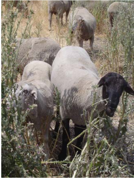
Sheep grazing on weeds at the Airport, a pesticide-free management strategy

The purpose of the Pesticide Management program is to reduce the amount of pesticides in stormwater and landscape runoff. Activities include setting municipal policy, implementing proper techniques when selecting and applying pesticides on City property, staff training, public education, and City participation in regional efforts to influence regulations that affect pesticide management. In 2003, the Council adopted an Integrated Pest Management (IPM) Policy, which calls for municipal operations to incorporate IPM techniques and to reduce, phase-out, and ultimately eliminate the use of pesticides that cause impairment of surface waters. The City continues to implement pest control BMPs and train staff on Integrated Pest Management (IPM) techniques. This program element is implemented pursuant to permit provision C.9.d.