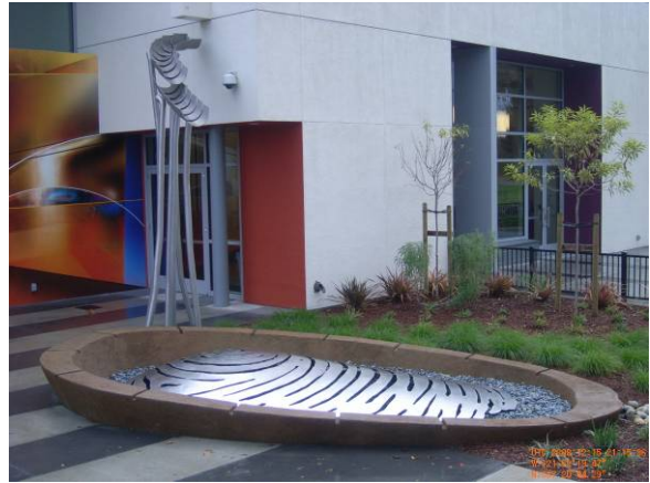
Stormwater treatment integrated with public art at Roosevelt Community Center

This compilation of annual work plans for the City of San José Urban Runoff Management Plan (URMP) has been developed for FY 2009-2010 pursuant to Section C.6.b of the City's Municipal Separate Storm Sewer System NPDES permit (No. CAS029718), Order 01-024. The work plans include tasks, responsibilities, and schedules needed to implement the program elements in the URMP with the overall intent to reduce stormwater pollution in the City's storm drains, creeks and rivers. The Environmental Services Department coordinates development and review of the work plans in cooperation with staff from all affected City departments.