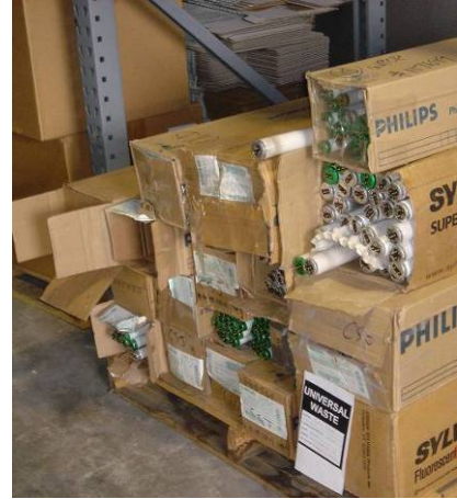
Fluorescent lamps for recycling at the Central Service Yard.

The City continues its efforts to reduce or eliminate mercury discharges during municipal operations. Virtual elimination practices employed by the City include: purchasing low mercury-containing fluorescent lamps, recycling spent lamps, recycling spent batteries, and switching to non-mercury-containing apparatus in the Water Pollution Control Plant Laboratory. In 2003, the Program approved a Guidelines document on the management of mercury-containing products by a municipal agency. The City will continue to implement management practices consistent with the guidelines such as collecting and recycling spent fluorescent lamps, batteries, and other electronic wastes. This program element is implemented pursuant to permit provision C.9.c.