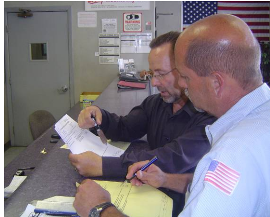
Watershed Enforcement Inspector reviewing an inspection report with a facility manager

The City’s Environmental Inspectors, located within the Watershed Protection Division of the Environmental Services Department, inspect more than 4,500 businesses per year to ensure that proper practices are employed to prevent stormwater pollution. How frequently a business is inspected depends on their potential for contributing pollutants as determined by previous inspection results. This method of assigning inspection frequencies has been effective in focusing limited inspection resources on high priority cases to best protect water quality. Generally, over 70% of the businesses inspected are found to have no significant stormwater issues and thus do not warrant near-term re-inspection. When issues are identified, education and enforcement are used together to achieve compliance. This Program element is implemented pursuant to permit provision C.2.