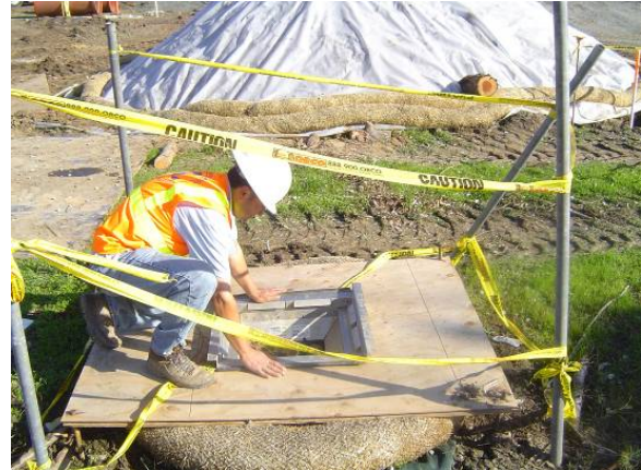
Proper stormwater management during construction, including drain protection, prevents sediment and other pollutants from entering the storm system

The City inspects activities at construction sites to prevent sediment and other pollutants from entering the storm sewer system. The measures and activities discussed in this work plan apply to both private development projects and municipal public works construction projects. These measures and activities are implemented at construction project sites as part of the City’s construction inspection and enforcement program, which is implemented as a collaborative effort between inspectors from Public Works, Building, and Environmental Services. These departments also collaborate in providing outreach materials and training to the development community on appropriate best management practices. This program element is implemented pursuant to permit provision C.2.