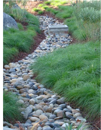
Bio-swale stormwater treatment control measure at Roosevelt Community Center

The City began phased implementation of hydraulic (also referred to as numeric) sizing requirements for stormwater treatment control measures in conformance with City Council approved Post-Construction Urban Runoff Management Policy 6-29 on October 15, 2003. Effective August 15, 2006, hydraulic sizing was required for all projects that create or replace 10,000 square feet of impervious surface. On October 18, 2005, Council approved Post-Construction Hydromodification Management Policy 8-14 and the City began implementation of hydromodification management requirements. This Program element is implemented pursuant to permit provision C.3.