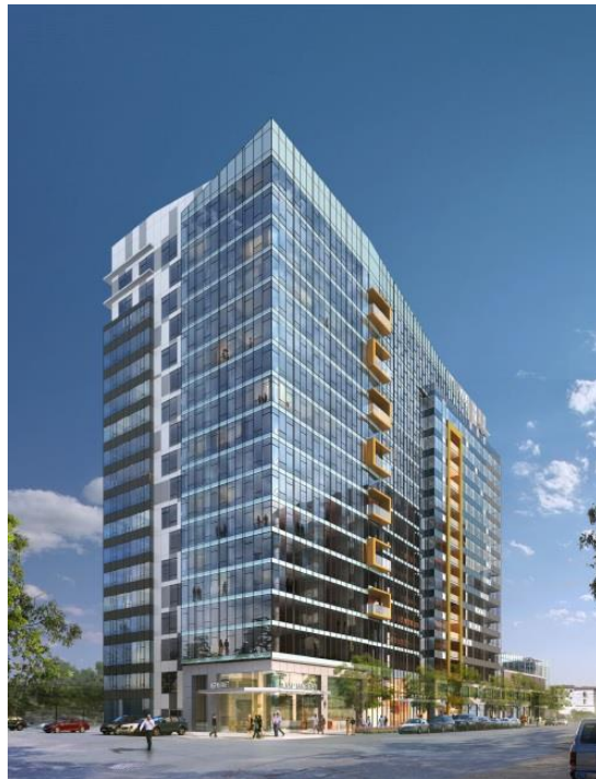
Figure 2 - View from W. Julian and Terraine streets