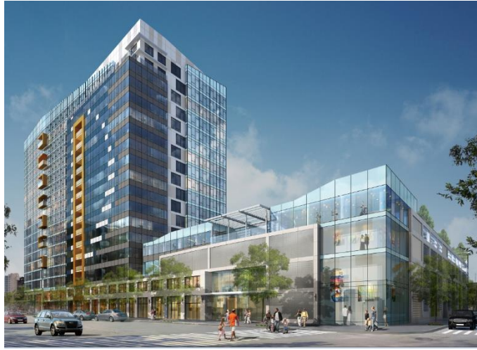
Figure 1 - View on Terraine Street