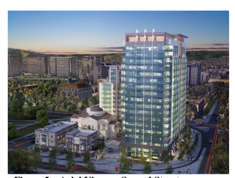
Figure 2 – Arial View on Second Street