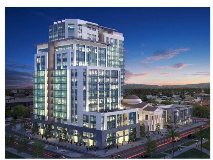
Figure 4 – View at First and St. James streets