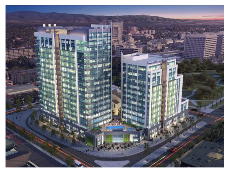
Figure 3 – Arial View of First and Devine streets