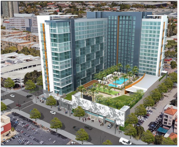
Figure 1 - Arial View on Second Street