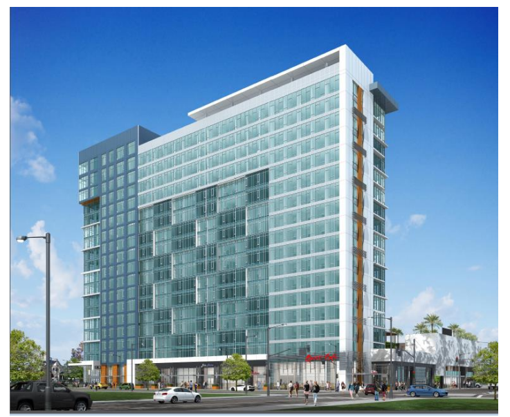
Figure 3 - San Carlos and Second Streets