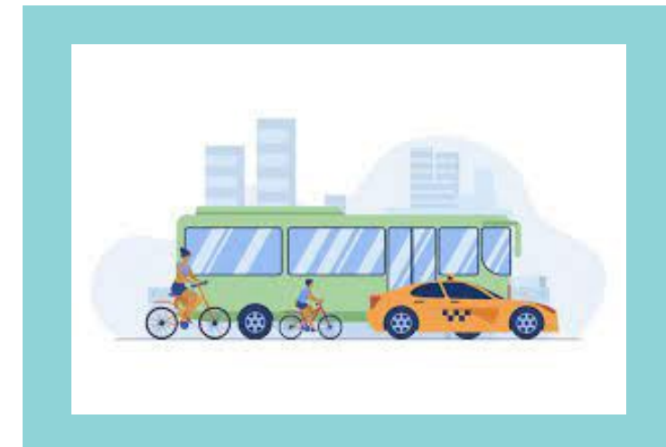
Reach Your Destination Easily by West Valley Community Services