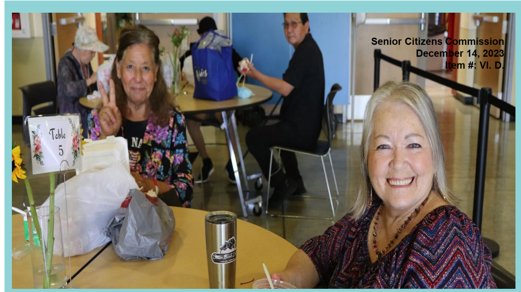
Senior Nutrition Program Northside Community Center