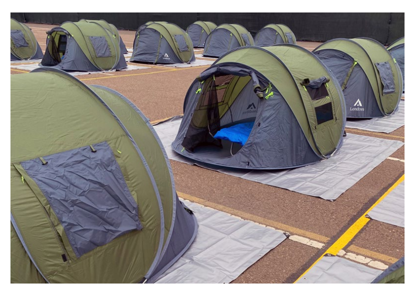
Safe sleeping site in San Diego

The City Manager is directed to identify one-time and ongoing funding to bring basic, low-cost, low-barrier safe sleeping sites online by the end of December 2024 — conditioned upon the Council approving one or more sites before July 2024 — with enough capacity to significantly reduce the number of unmanaged encampments along our waterways. Furthermore, and aligned with the MBA proposed by Councilmembers Doan and Batra on low-barrier solutions to homelessness, the City Manager should include a broader evaluation of low-cost strategies and potential sites — including Valley Water sites — with the goal of moving people out of our waterways over time while preventing homeless residents from being displaced into other neighborhoods. When evaluating congregate shelter opportunities, specific attention should be allotted to models that prioritize the physical and mental well-being of residents.