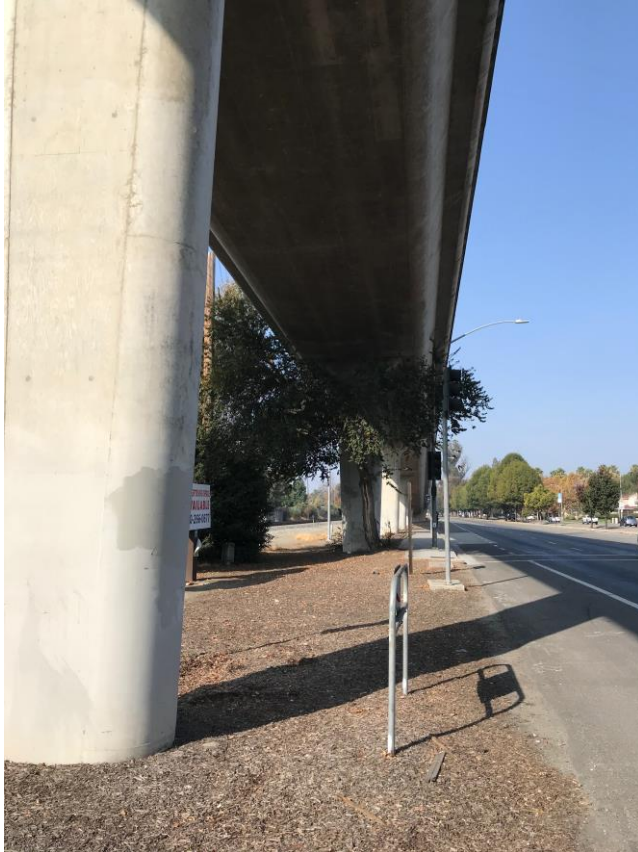
Photo 1: Columns on the southbound Monterey to westbound Blossom Hill connector ramp