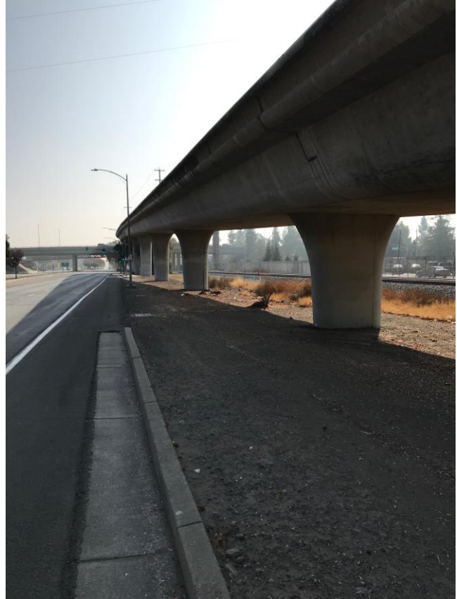
Photos 2 & 3: Columns on the southbound Monterey to westbound Blossom Hill connector ramp

SITE 2: The Blossom Hill overcrossing bridge support columns.