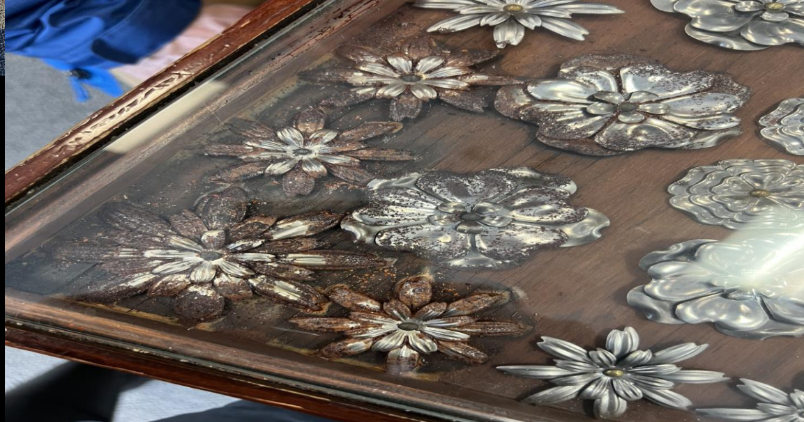
Recolecciones by Mel Chin. Multiple artwork conservation efforts at MLK library. Estimated Cost $19,000