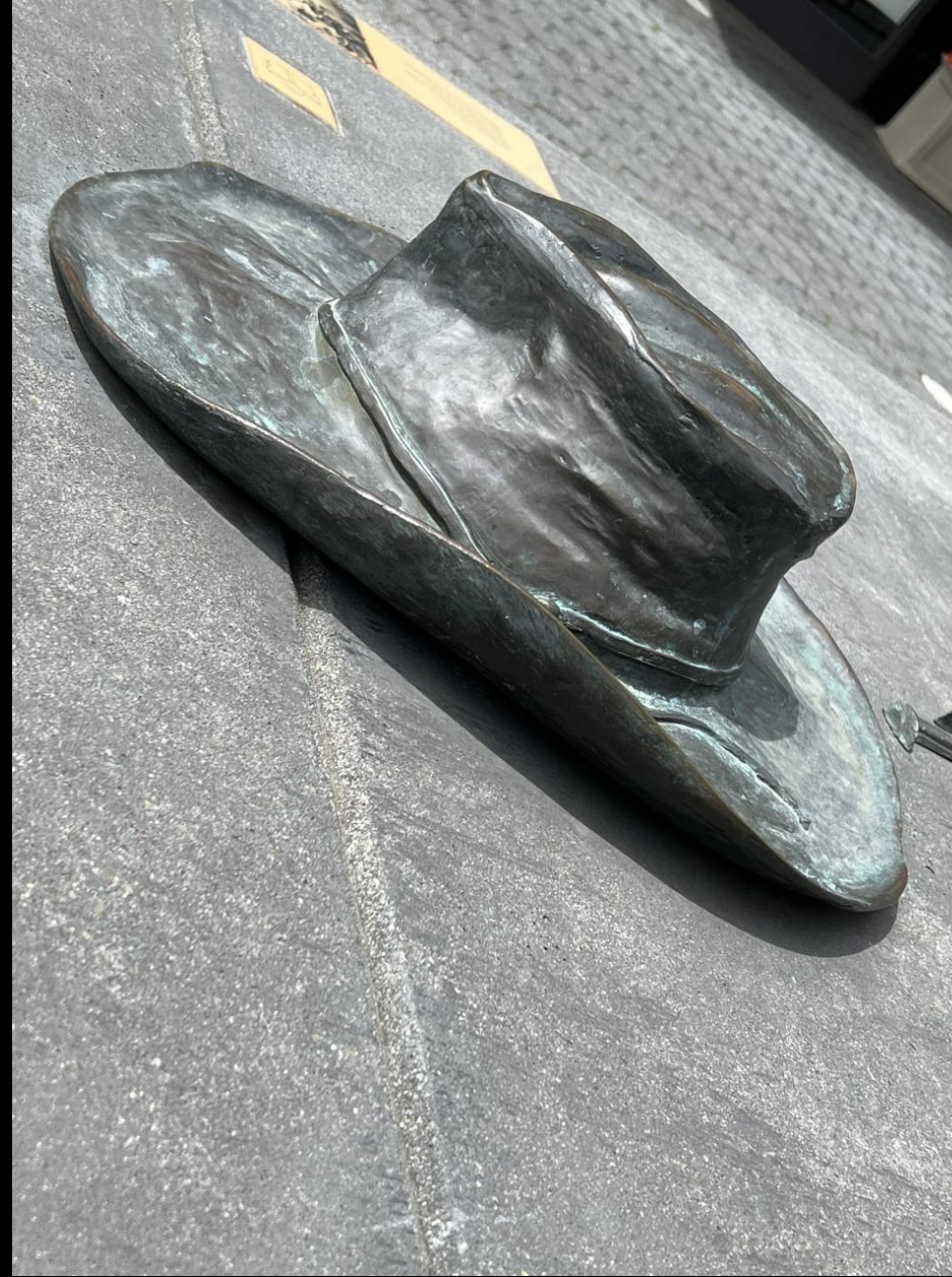
Man of Fire by Kim Yasuda: polishing, and cement stain. Estimated cost $7,000