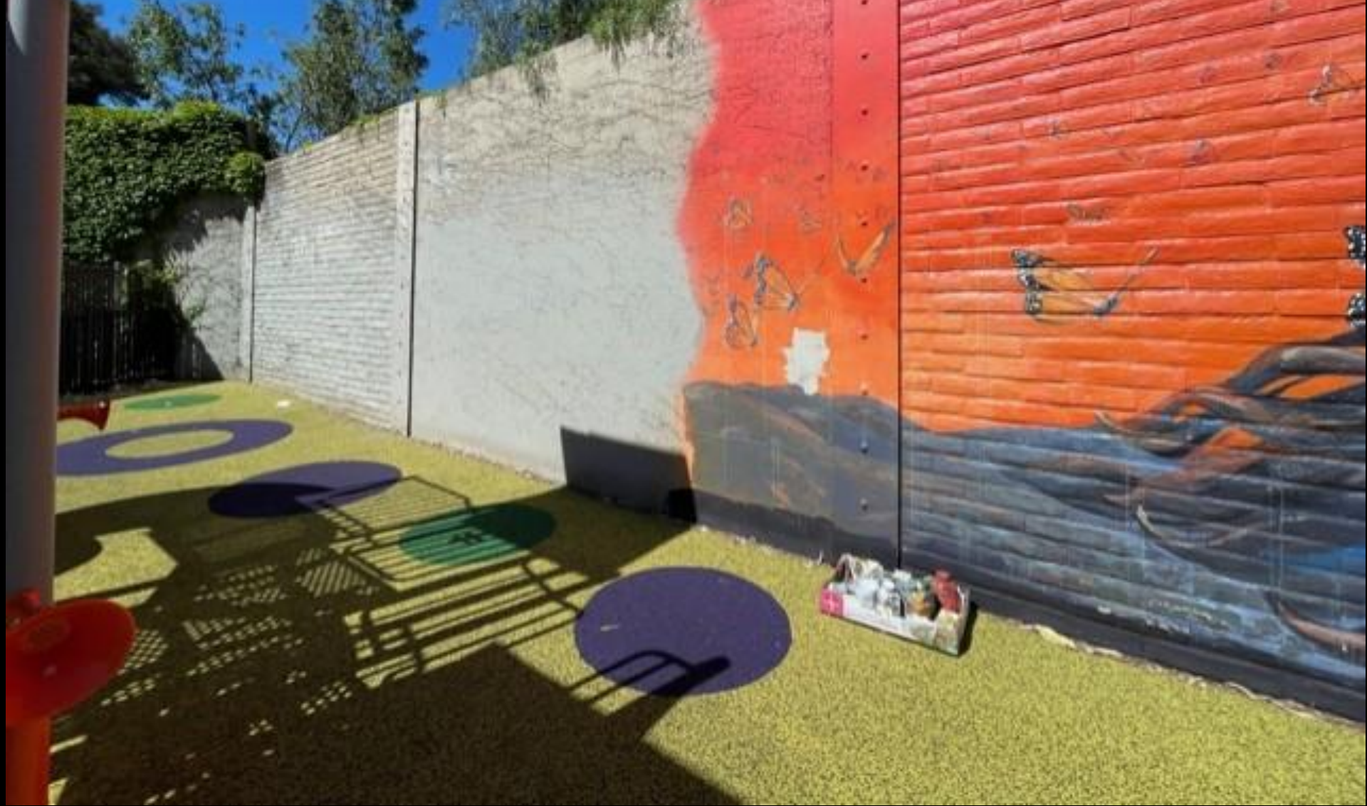
El Sueño de la Mariposa by Morgan Bricca. Touch up work needed as well as extension for where vine has died work deteriorating, repairs needed. Estimated cost $7,500.