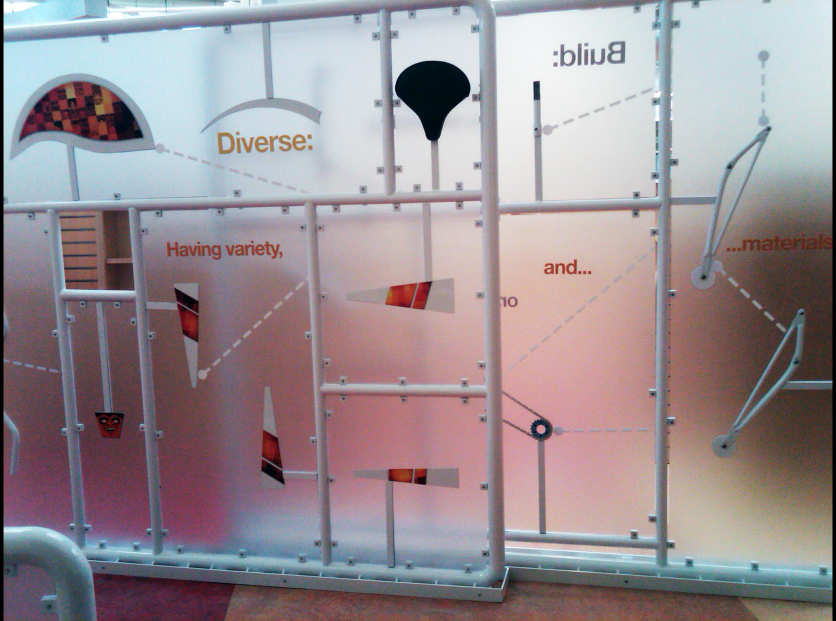
Potential by Sam Rodriguez, minor repairs to various bicycle components. Estimated cost $1,500.