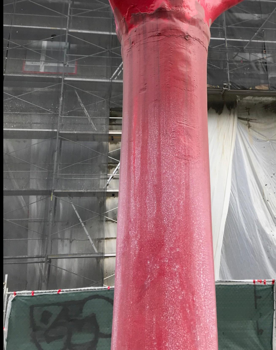
Red Tree by Hector Mendoza, cleaning, repainting, and UV/AG clearcoat required. Estimated cost $3,000.