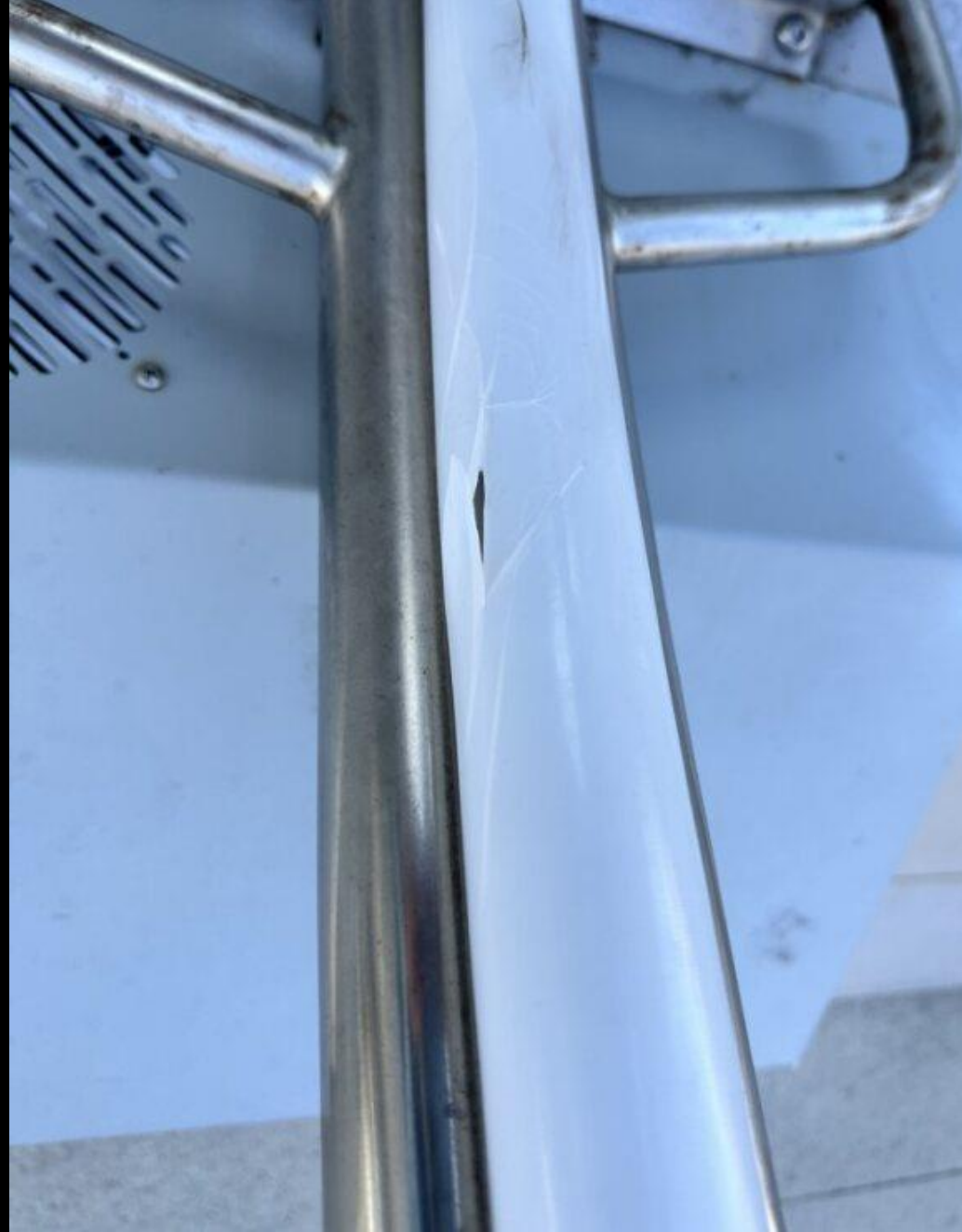
Sonic Runway by Jensen/Trezevant: diffuser replacement $6,000