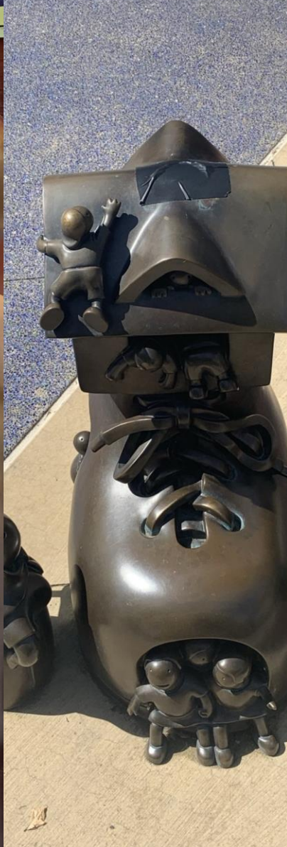
Another World by Tom Otterness. Vandal broke off components of various sculpture elements. Estimated cost $25,000.