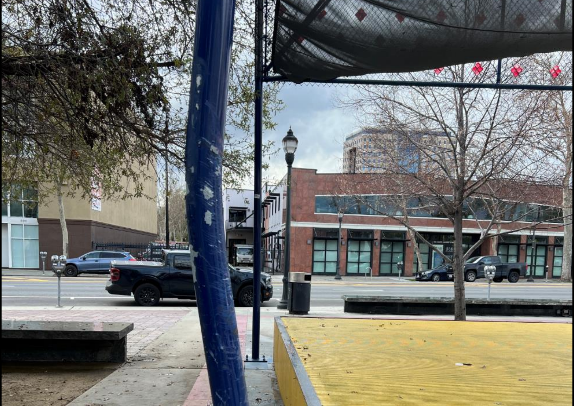
Urban Rooms by Forman and Cruz: pole replacement $6,000