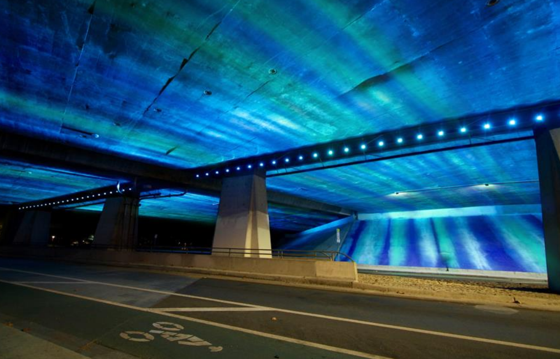
Another World by Tom Otterness. Vandal broke off components of various sculpture elements. Estimated cost $15,000.