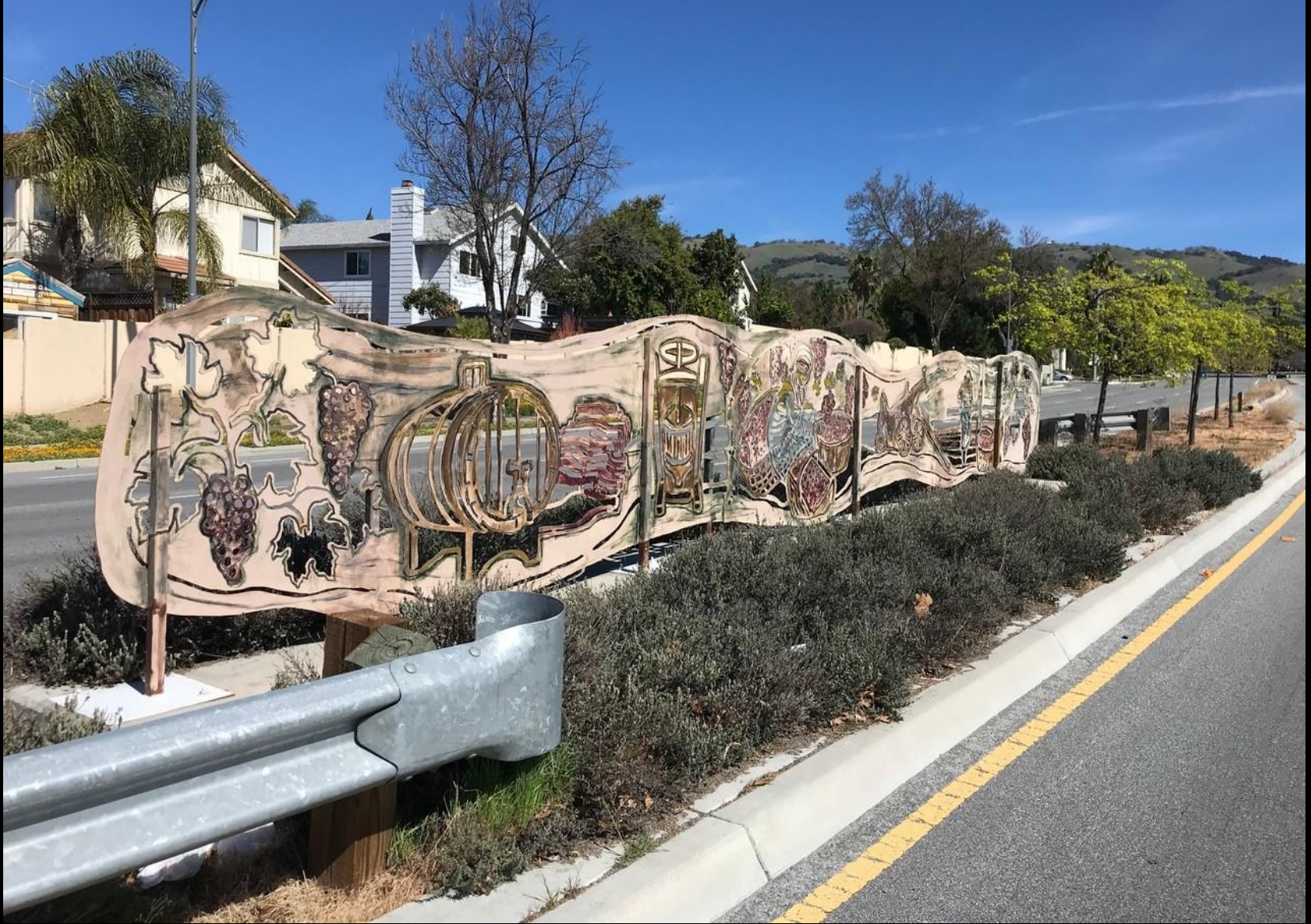
Mirassou by Eric Powell, re-paint, Anti-Graffiti, Ultraviolet, rust protectant application required. Estimated Cost $3,000.