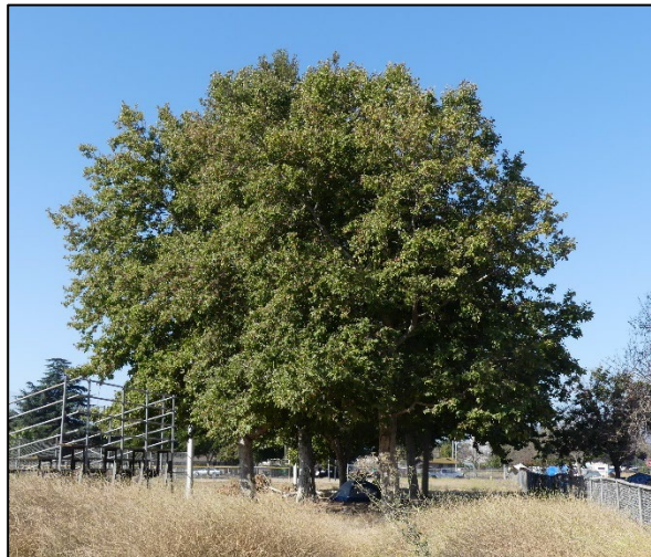
Photo 10. Looking west at grove of western sycamores.