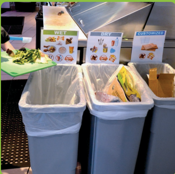
An example of labeled receptacles provided to allow for proper sorting

Containers are carts, bins, dumpsters, roll-offs, and compactors emptied by Republic Services.