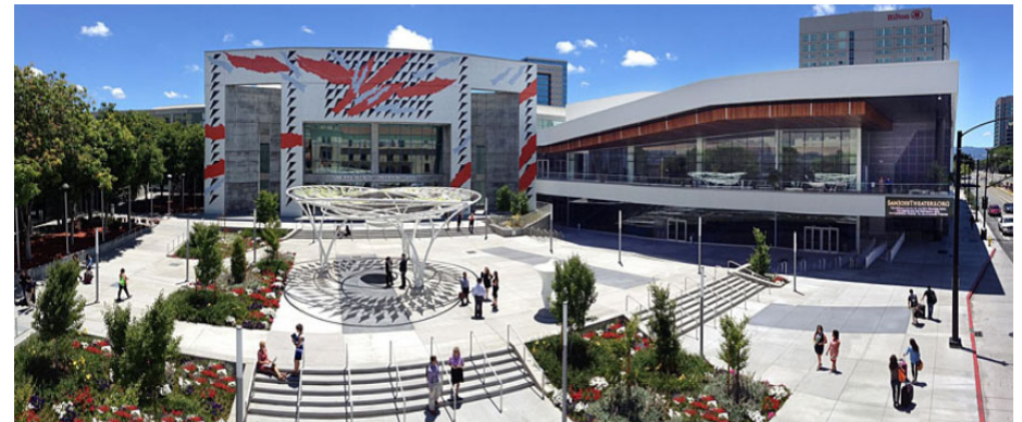
San José McEnergy Convention Center