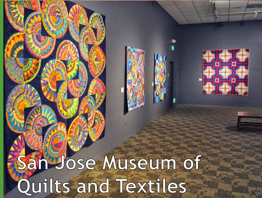
San Jose Museum of Quilts and Textiles