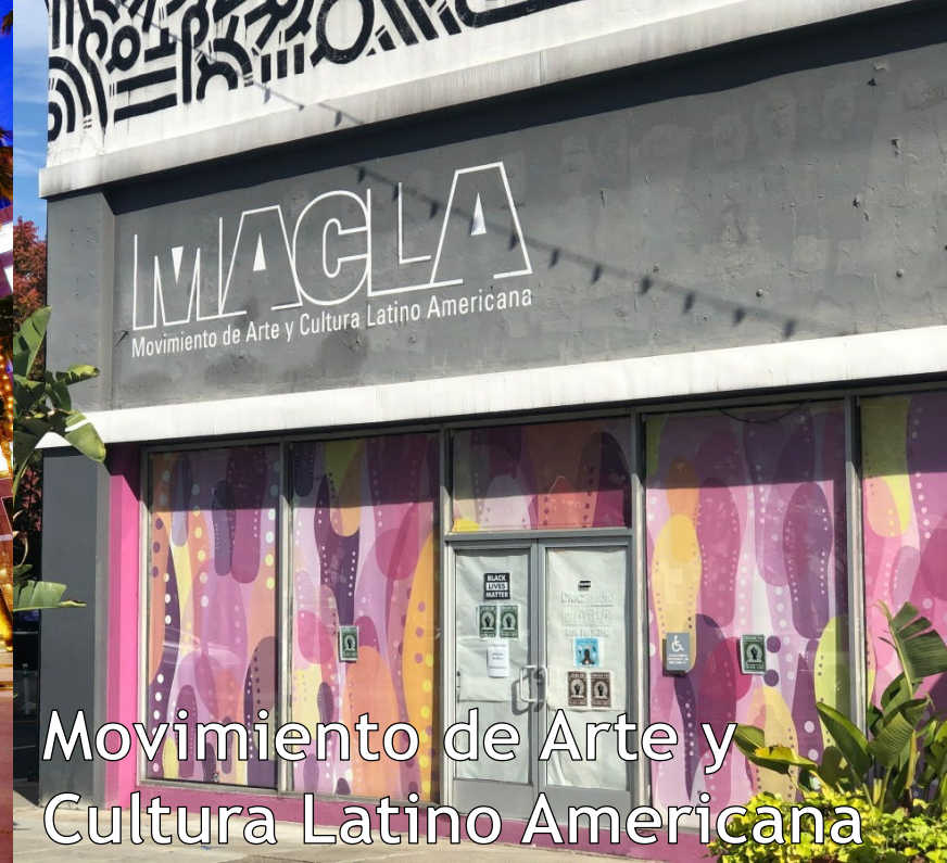
Movimiento de Arte y Cultura Latino Americana