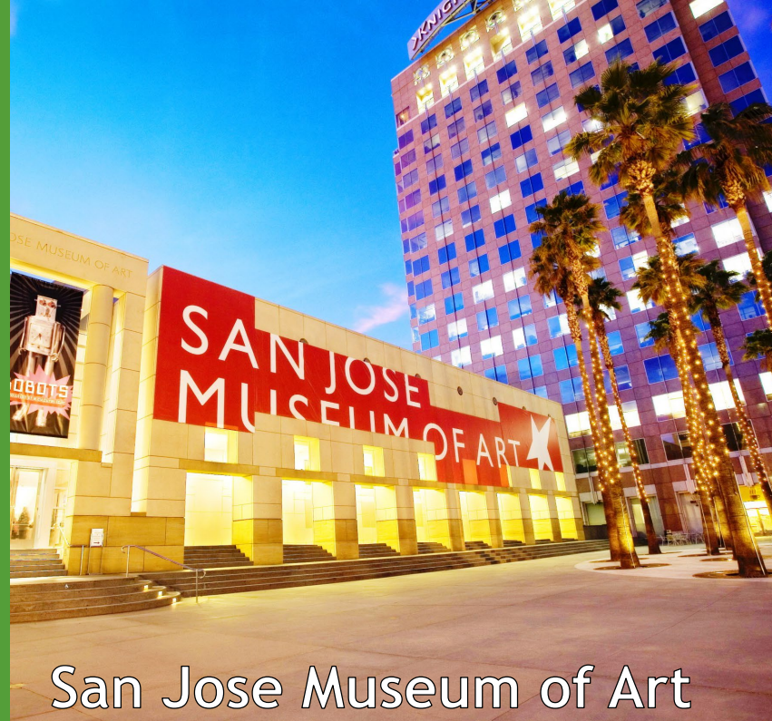
San Jose Museum of Art