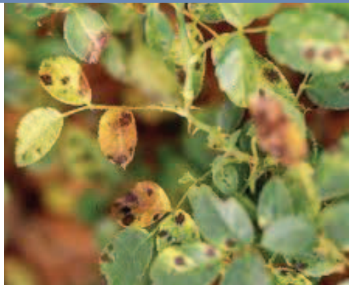
Downy Mildew or Black Spot on Rose Leaves