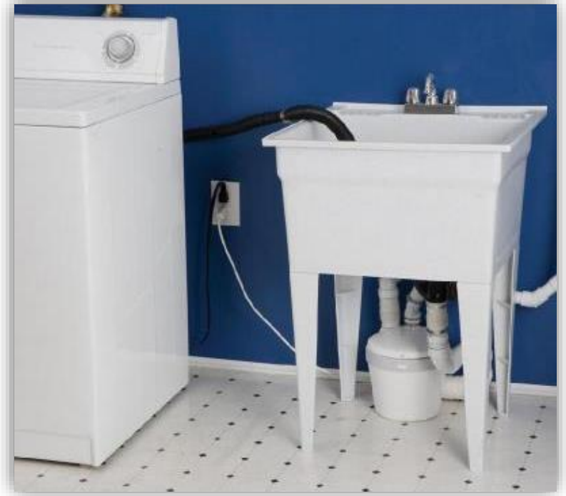
A hose directing wastewater to a utility sink, which drains into the sewer system.