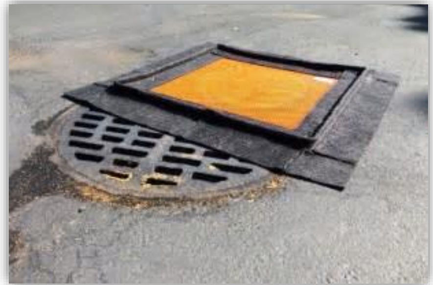
A storm drain covered with a mat.