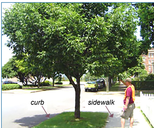
Example of a street tree