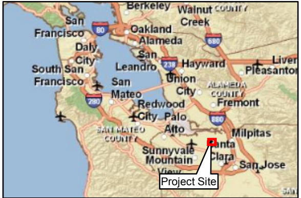
FIGURE 2 Proposed San José Bay Trail Reach 9 Alignment

Environmental Assessment for San José Bay Trail Reach 9 City of San José, California