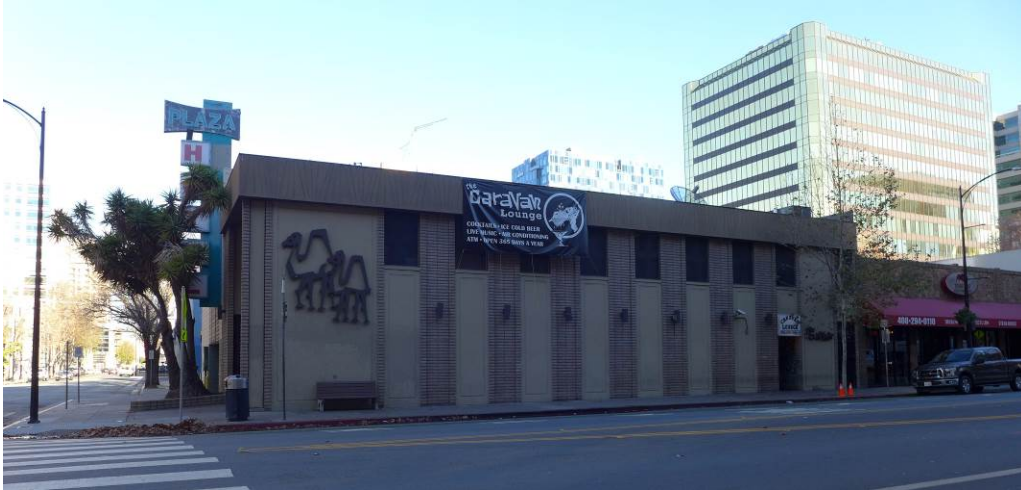
Figure 17: The Caravan Lounge viewed from across W. San Fernando Street.

The structure at 98 S. Almaden Avenue does not appear to be eligible for the CRHR under Criterion 1 as the construction of the building does not relate to a historic event or trend in local, state, or national history. No persons of significance are known to be associated with the property; thus, it does not appear to be eligible for the CRHR under Criterion 2. The structure is not a work of a master, does not convey high artistic value, and is not an example of a particular type of construction. Therefore, the building does not appear to be eligible for the CRHR under Criterion 3. The property is unlikely to yield information that is significant to history or prehistory and does not appear to be eligible under Criterion 4.