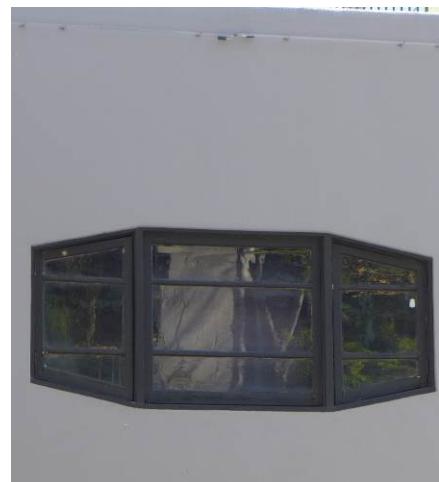
Figures 4 and 5: The Berger Building viewed from across S. Almaden Ave. (left). Octagonal window above the rolling door (right).