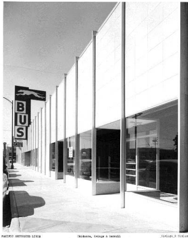
Figure 11: The completed Greyhound Bus Station. 54