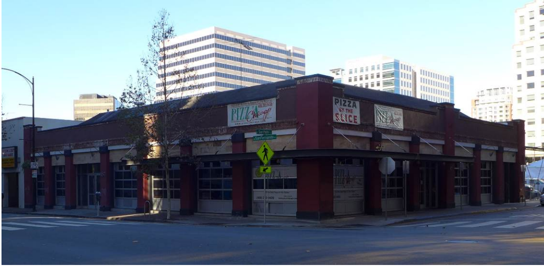
Figure 19: 155-159 W. San Fernando Street/97 S. San Pedro Street viewed from across the street.

The structure at 155-159 W. San Fernando Street/97 S. San Pedro Street does not appear to be eligible for the CRHR under Criterion 1 as the construction of the building does not relate to a historic event or trend in local, state, or national history. No persons of significance are known to be associated with the property; thus, it does not appear to be eligible for the CRHR under Criterion 2. The structure is not a work of a master, does not convey high artistic value, and is not an example of a particular type of construction. Therefore, the building does not appear to be eligible for the CRHR under Criterion 3. The property is unlikely to yield information that is significant to history or prehistory and does not appear to be eligible under Criterion 4.