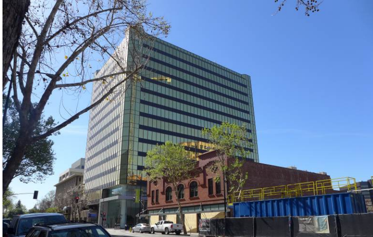
Figure 2. The Market-Post Tower viewed from across Market Street.