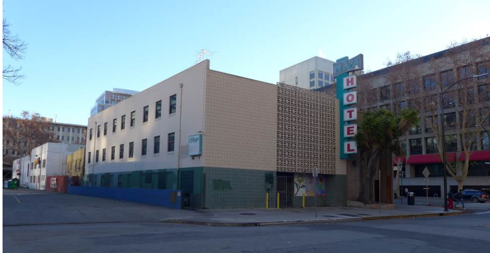
Figure 16: The Plaza Hotel viewed from across S. Almaden Ave.

The structure at 96 S. Almaden Ave. does not appear to be eligible for the CRHR under Criterion 1 as the construction of the building does not relate to a historic event or trend in local, state, or national history. No persons of significance are known to be associated with the property; thus, it does not appear to be eligible for the CRHR under Criterion 2. The structure is not the work of a master, does not convey high artistic value, and is not an example of a particular type of construction. Therefore, the building does not appear to be eligible for the CRHR under Criterion 3. The property is unlikely to yield information that is significant to history or prehistory and does not appear to be eligible under Criterion 4.