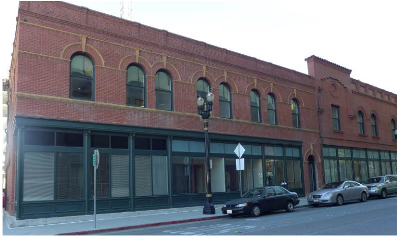
Figure 1. The Sunol Building viewed from across San Pedro Street.