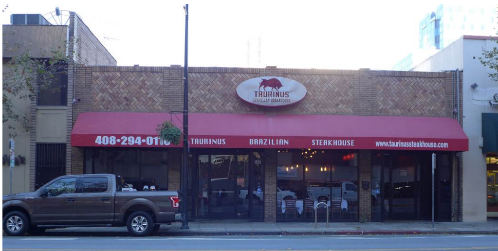
Figure 12. Street elevation of 167-171 W. San Fernando Street.

Brushed brick in a herringbone pattern adorns the area above the metal storefronts. A large, fixed awning spans the length of the building and shelters the main entry and a secondary entry. The awning hides the transom windows above the doors.