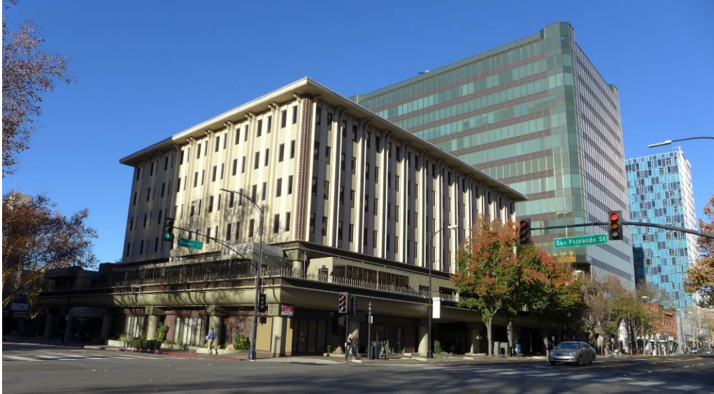
Figure 20: 95 S. Market Street viewed from across the street.