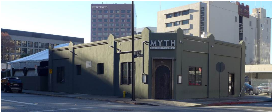
Figure 13: The Myth Taverna viewed from across San Pedro Street.

The one-story brick building was constructed in 1933. The structure originally housed a restaurant and a shop. Two bays front Post Street and three bays from San Pedro Street. At street corner the building has an angle wall with a door which is the main entrance to the structure. The stucco clad building has a slight parapet between the pilasters that mark the bays. The pilasters project above the parapet and are capped by a point. The multi-lite windows may be original; however, the original doors have been lost. It is evident in several locations that openings have been in filled. Today the building is the location for the Myth Taverna Restaurant. 64