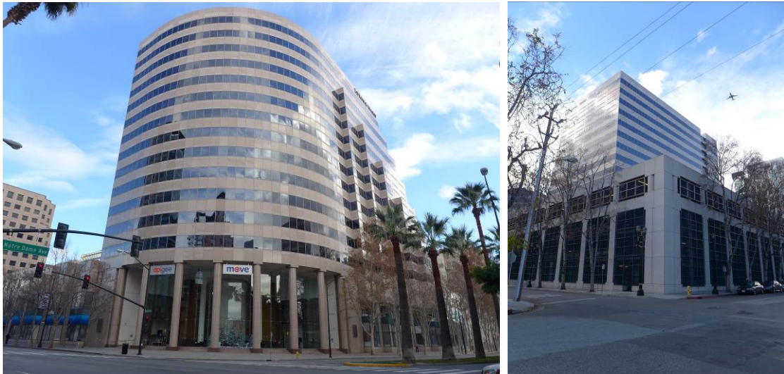
Figures 21 and 22: The entrance to the Citibank Building viewed from across the street (left). The parking portion of the building (right).