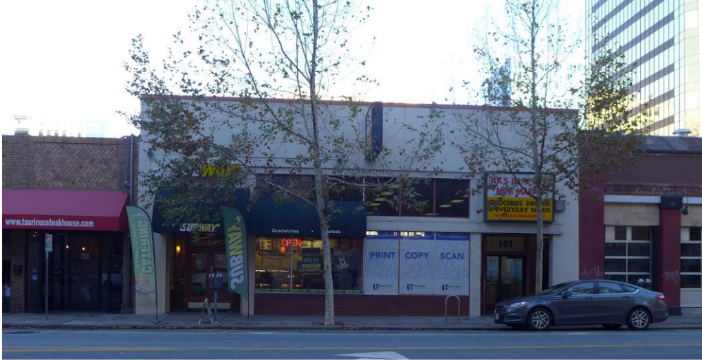
Figure 18: 161-165 W. San Fernando Street viewed from across the street.

The structure at 161-165 W. San Fernando Street does not appear to be eligible for the CRHR under Criterion 1 as the construction of the building does not relate to a historic event or trend in local, state, or national history. No persons of significance are known to be associated with the property; thus, it does not appear to be eligible for the CRHR under Criterion 2. The structure is not a work of the master, does not convey high artistic value, and is not an example of a particular type of construction. Therefore, the building does not appear to be eligible for the CRHR under Criterion 3. The property is unlikely to yield information that is significant to history or prehistory and does not appear to be eligible under Criterion 4.