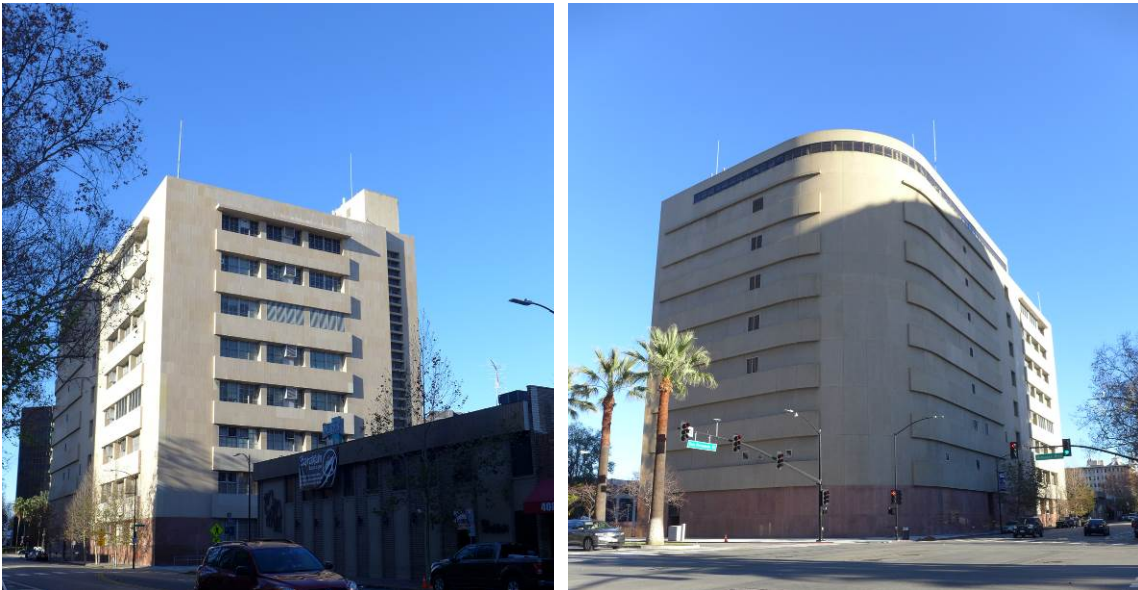
Figures 14 and 15: The original portion of the AT&T Building with the earlier additions (left). The later additions to the AT&T Building (right).

This nine-story, corporate modern style office and utility building, constructed 1947 and added to several times, is rectangular in plan with a curve at the southwest corner. The steel reinforced concrete structure has several cladding materials – precast cementitious panels with varying aggregate sizes, stucco and granite. A flat roof accommodates many mechanical systems. The primary window type is steel-sash, four-over-four, double-hung. The windows are grouped in pairs. Some have been replaced with metal louvered vents. At the main entry a contemporary aluminum and glazed storefront is recessed and accessed by several steps. Notable features include the projecting bands below the windows on the older part of the structure and the bands that carry over to the newer additions, the recessed openings, and the curved corner. Alterations to the building include multiple additions (1957, 1961, 1968 and 1974), the removal of windows replaced with louvers or other vents, and the replacement of the front entry. 65 The overall condition of the AT&T office and utility building is good.