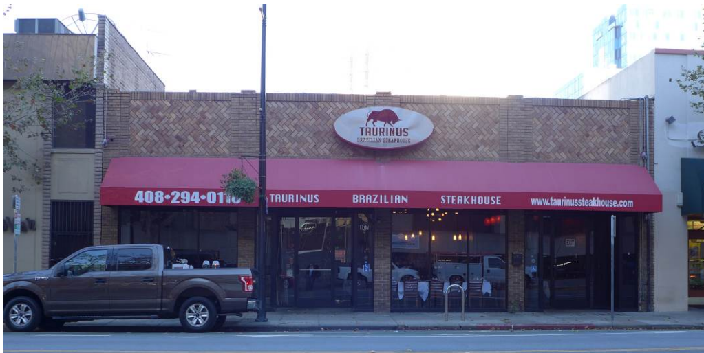
Figure 12. Street elevation of 167-171 W. San Fernando Street.

This one-story brick commercial building features four bays divided by vertical brick piers. Each bay has a metal storefront. Originally, the building housed four separate commercial units. Brushed brick in a herringbone pattern adorns the area above the metal storefronts. A large, fixed awning spans the length of the building and shelters the main entry and a secondary entry. The awning hides the transom windows above the doors.