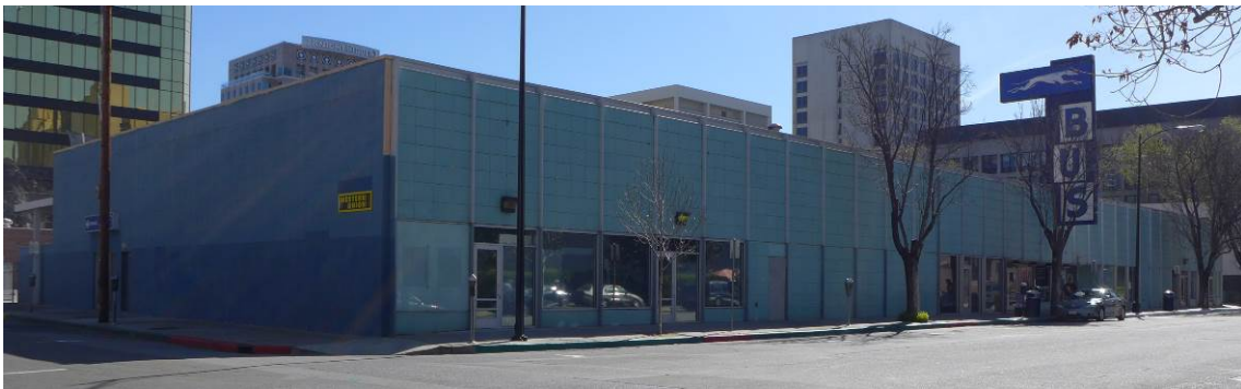
Figure 6: The Greyhound Bus Station viewed from across S. Almaden Avenue.

The one-story cinder block building clad with glazed terracotta tile was constructed in 1957 to function as a bus station. The large structure (280 feet long and 115 feet deep) cost over a million dollars to build. 45 Vertical aluminum members divide the building into bays. Aluminum storefront configurations face S. Almaden Ave. Today many of the storefronts are vacant. A large electric sign identifies the building and features the figure of a greyhound and the word “BUS.” Buses park at the rear of the building. The rear of the structure has a large overhang to shelter waiting and disembarking passengers. Painted steel columns support the overhang. The interior features air conditioning, terrazzo floors and wide open spaces. Interior alterations to the building appear to be limited. The building is designed in a modern style and makes use of modern materials. The style of the building is best described as commercial modern. The massing of the building is horizontal, the roof is flat, the structural system is expressed on the exterior, a large sign is attached to the structure and modern cladding materials are used reflecting the commercial modern style. Credited with the design of the bus terminal is the noted American architectural firm Skidmore, Owings and Merrill. 46 (This section on the Greyhound Bus Station was taken from the Post and San Pedro Draft Tower Historic Resources Technical Report prepared in 2014 by Carey & Co., Inc.)