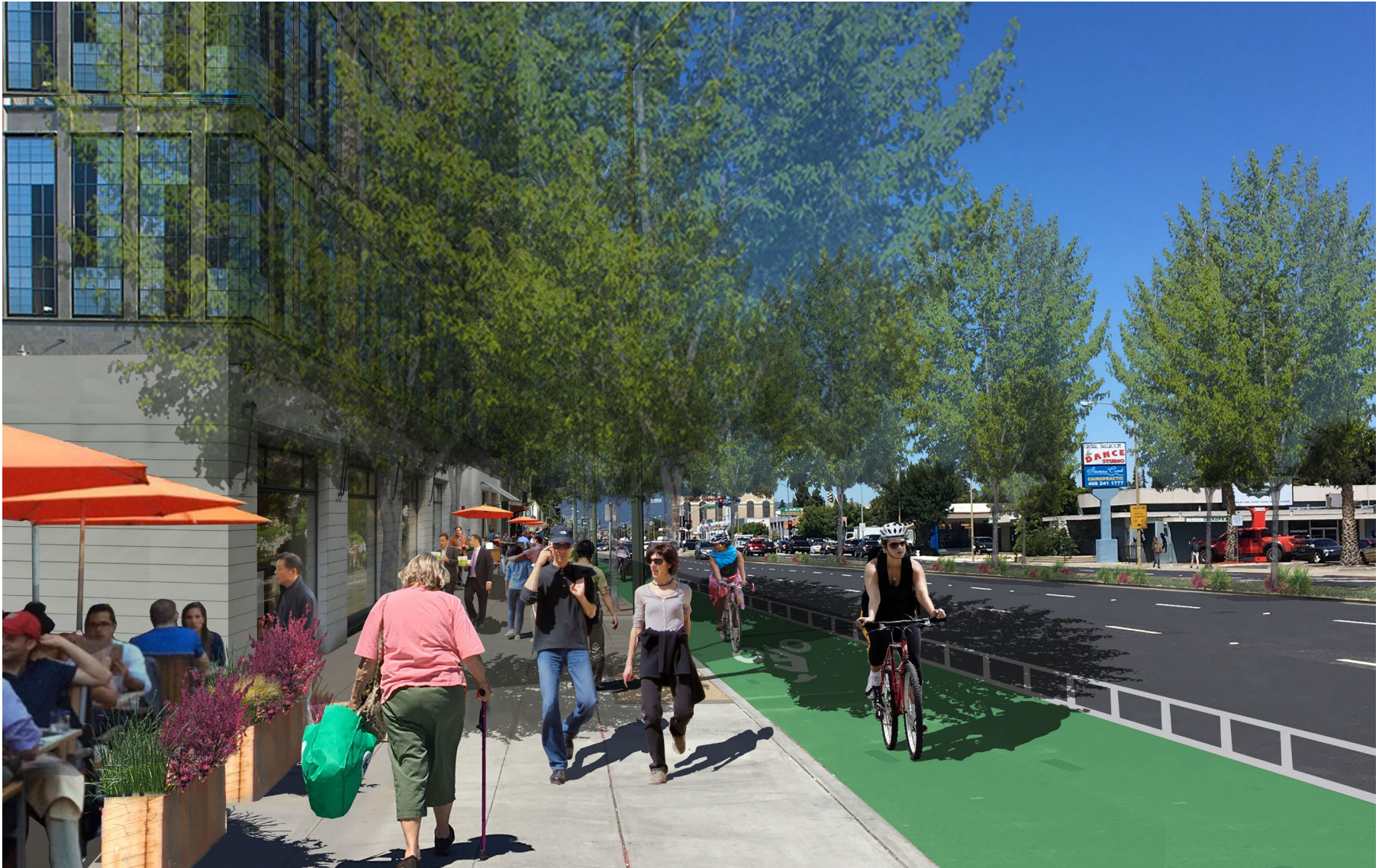
Illustration of what a vibrant Stevens Creek Urban Village could look like (Stevens Creek Boulevard at Harold Ave)