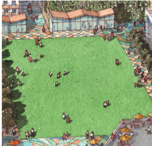
New Parks and Gathering Spaces

The Stevens Creek Urban Village will spur development of new parks and public gathering spaces that integrate a variety of new connected outdoor spaces where the community can meet, linger, and socialize.