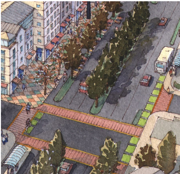
A Great Street

Transform Stevens Creek Boulevard into a truly great street that is safe, accessible, and convenient, while also remaining a key segment of the regional roadway system that is prominent, memorable, and functions well for all users. Provide a safe, accessible, and well-connected community for all people and ideals, with continuous, wider sidewalks and protected bicycle lanes.