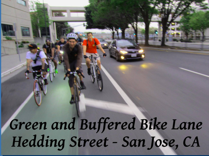
Green and Buffered Bike Lane Hedding Street - San Jose, CA