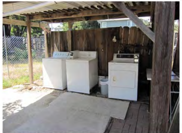
Photograph 4. Canopy coverer laundry machines.