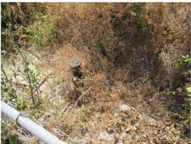
Photograph 5. Black ABS access pipe to reported septic tank.