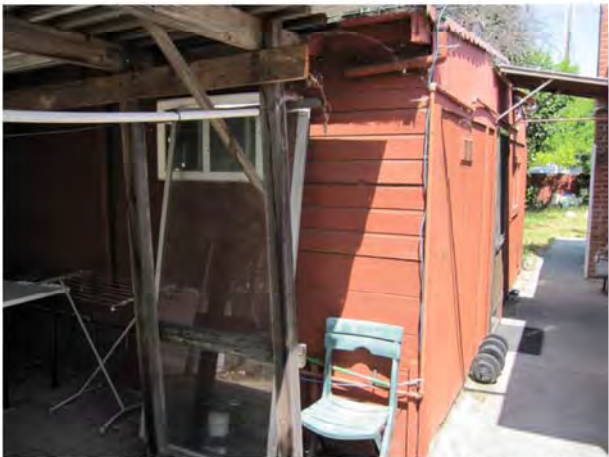
Photograph 3. Accessory structure used as residence.