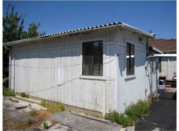
Photograph 2. Accessory structure used as residence.