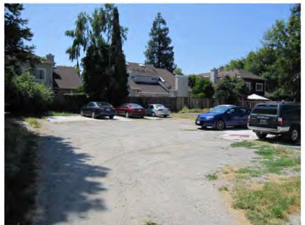
Photograph 6. Rear gravel and dirt covered parking area, looking southeast.