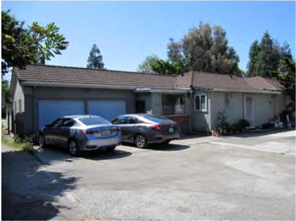
Photograph 1. View of the on-site residence looking southwest.