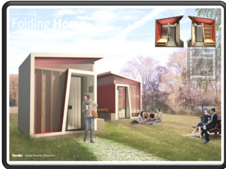
Bridge Housing Community – San Jose, CA