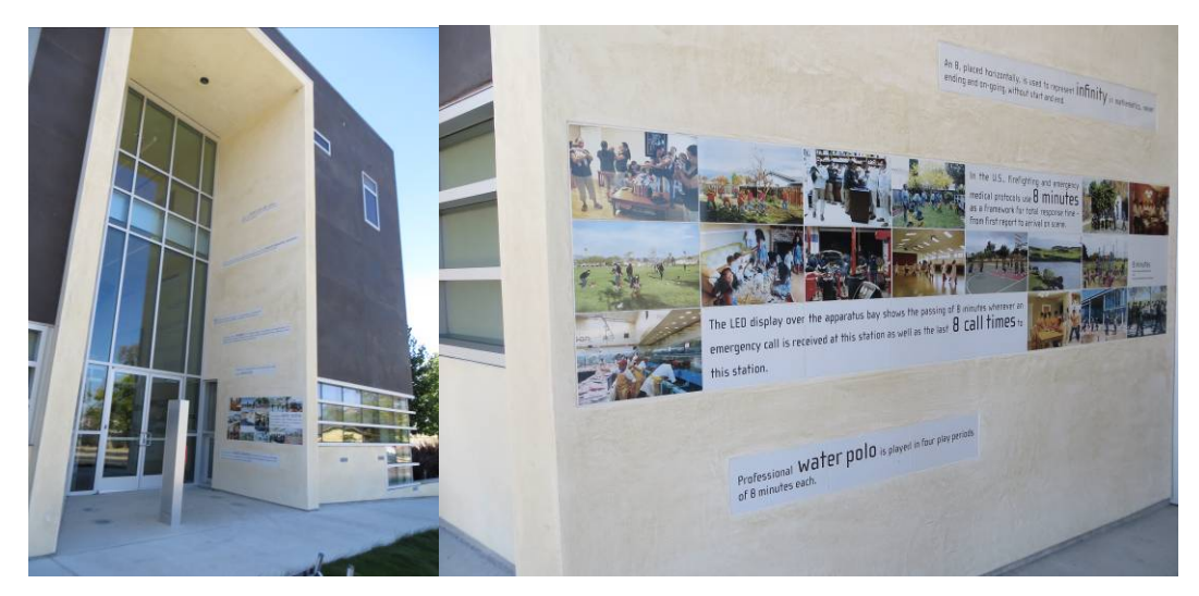
Installation view of the community tile and text murals by Merge Conceptual Design

More of their work may be seen at www.mergeconceptualdesign.com