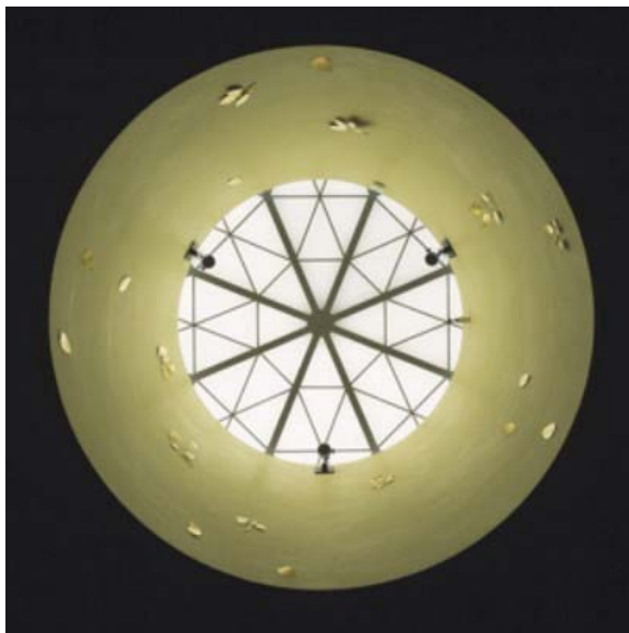
Above: Marketplace Skylight Well

The artwork is placed beneath four 8' diameter skylights within the library: