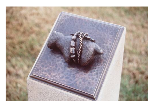
Above: Bronze cast of Zuni bear fetish

four-leaf clover, a hand milagro, a scarab, a rabbit's foot, a bat, and a Zuni bear fetish. Each of these objects has a connection to good fortune such as the milagro, a religious folk charm traditionally used for healing. McCarren chose a hand milagro because of the universality of a hand as an amulet.