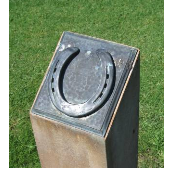
Above: Bronze cast of horseshoe

four-leaf clover, a hand milagro, a scarab, a rabbit's foot, a bat, and a Zuni bear fetish. Each of these objects has a connection to good fortune such as the milagro, a religious folk charm traditionally used for healing. McCarren chose a hand milagro because of the universality of a hand as an amulet.