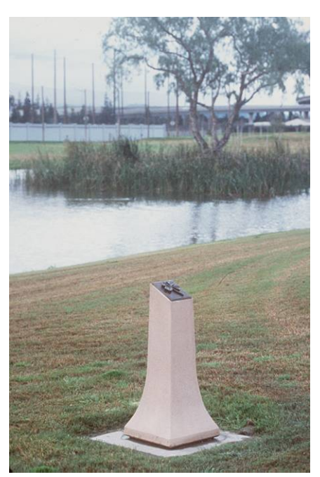
Above: Bronze cast of four leaf clover

Foretokens is a series of cast bronze amulets attached to sculptural bases placed at every tee at the Rancho Del Pueblo Golf Course.