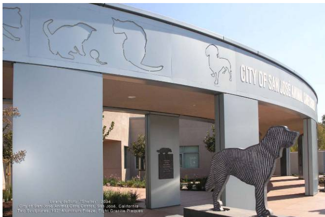
Above: View of sentinel statue and entrance

The “Gallery of Myths” is a series of eight granite tablets along the portico of the building, which describe stories, myths, or aphorisms about cats and dogs connecting humanity with the myths of pets.