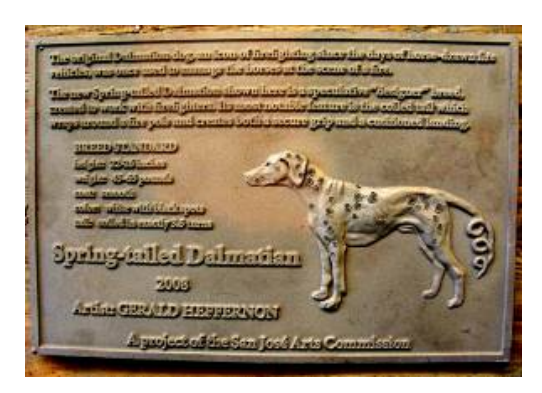
Above: the custom plaque