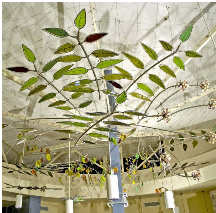
Overview of Web of Native Botanicals

Entering the Marketplace, the glass and steel plant forms reveal themselves as a canopy suspended overhead. The work emanates in clusters around the column rising through the center of the room and floats like a huge bouquet cascading into the upper vaulted space of the Marketplace. Four different California native plants are represented: redbud, purple needle grass, California buckwheat and black walnut.