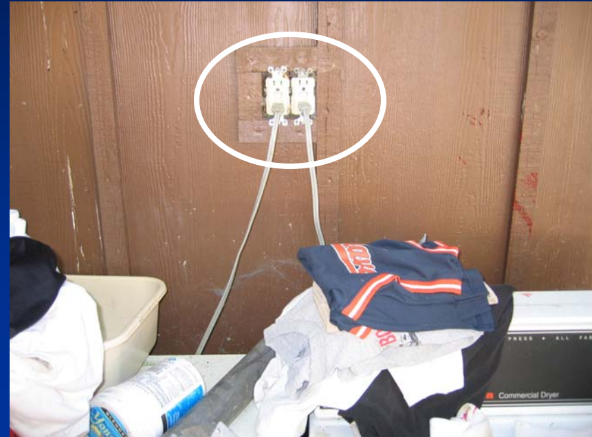
Camp Staff Washing and Drying Area