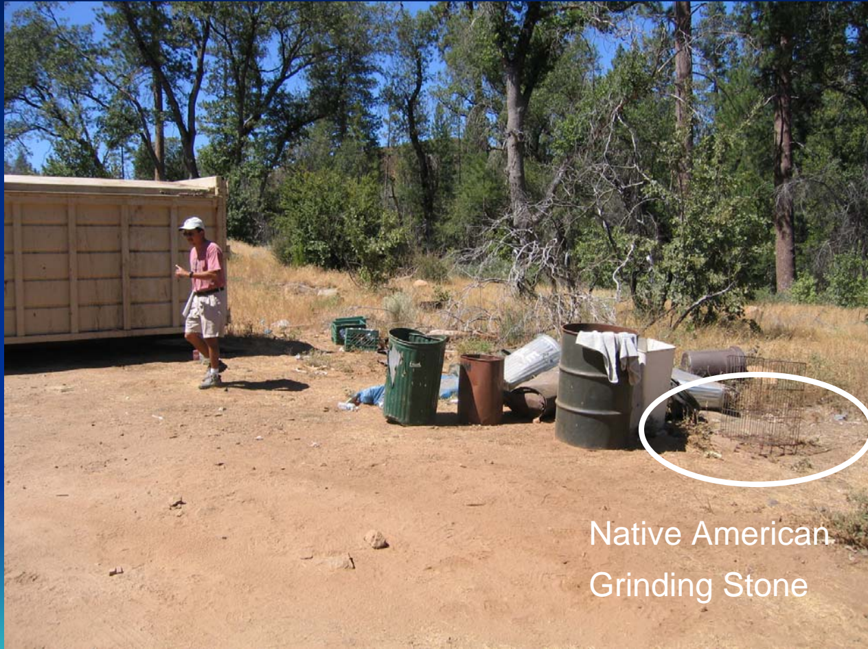
Native American Grinding Stone