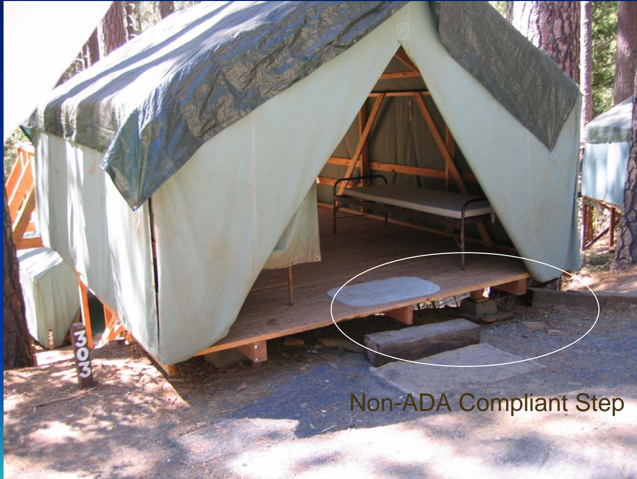
Non-ADA Compliant Step