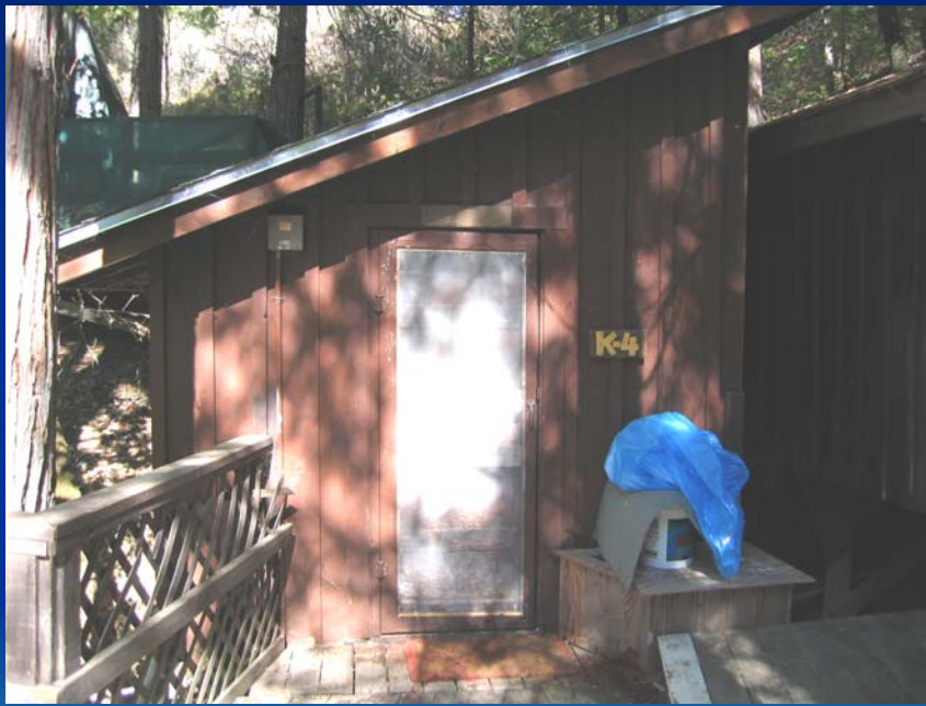
Outside of Staff Cabin