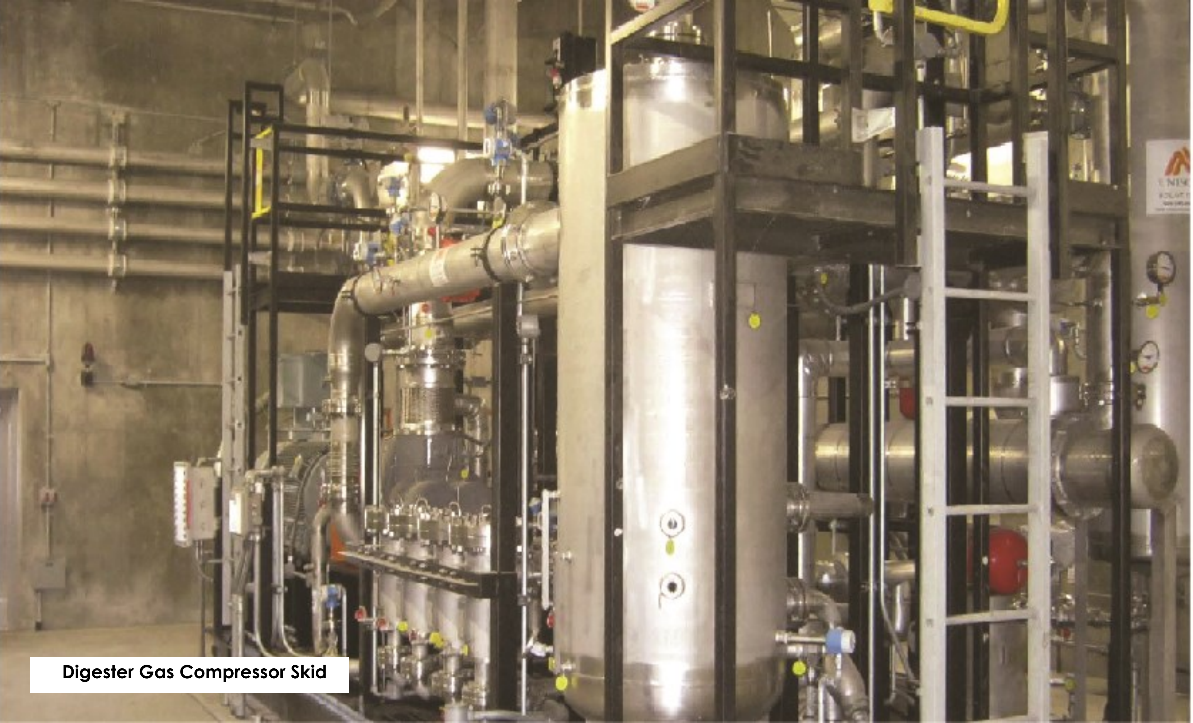
Digester Gas Compressor Skid