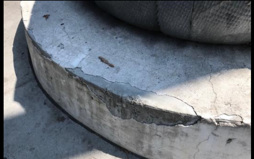
Plumed Serpent by Robert Graham. Concrete finish around base is chipping and cracking away. Bronze plaque to be waxed and polished. Estimated cost $12,000.