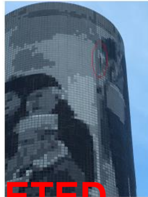
Peggy Fleming Column: Tile has separated from concrete substructure.