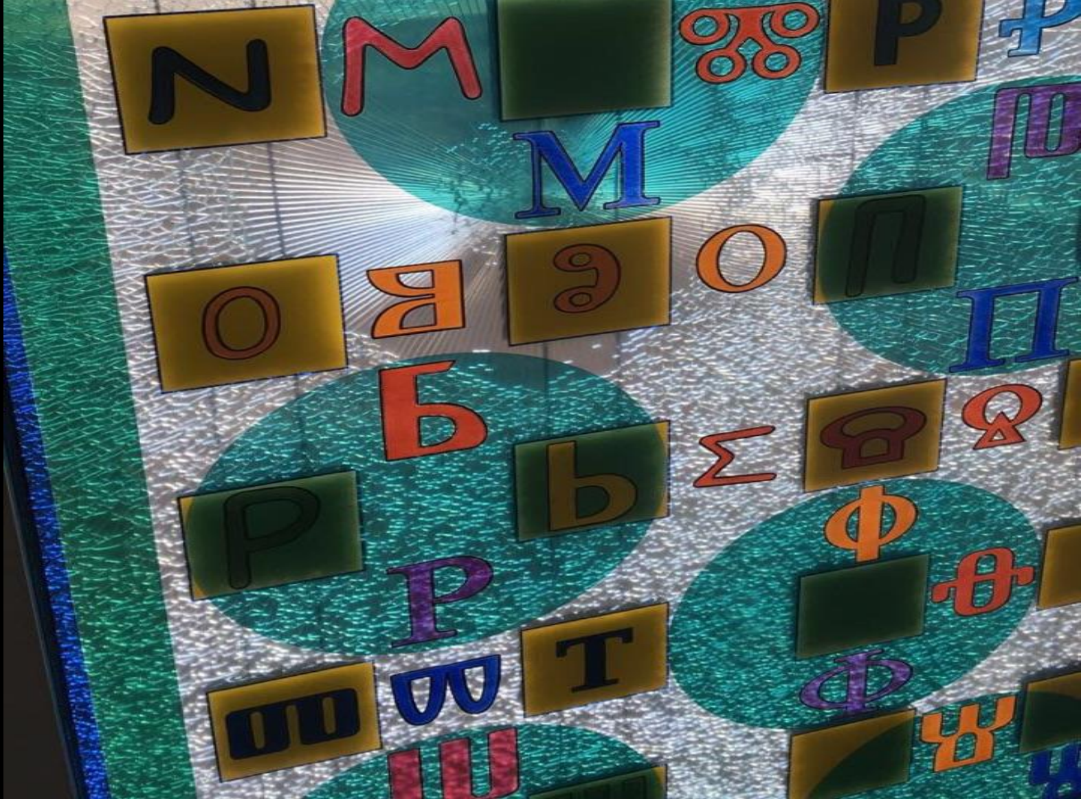
Solar Illumination I , Lynn Goodpasture. Outside layer of glass damaged, and internal photovoltaic glass is shattered. Estimated cost $22,000