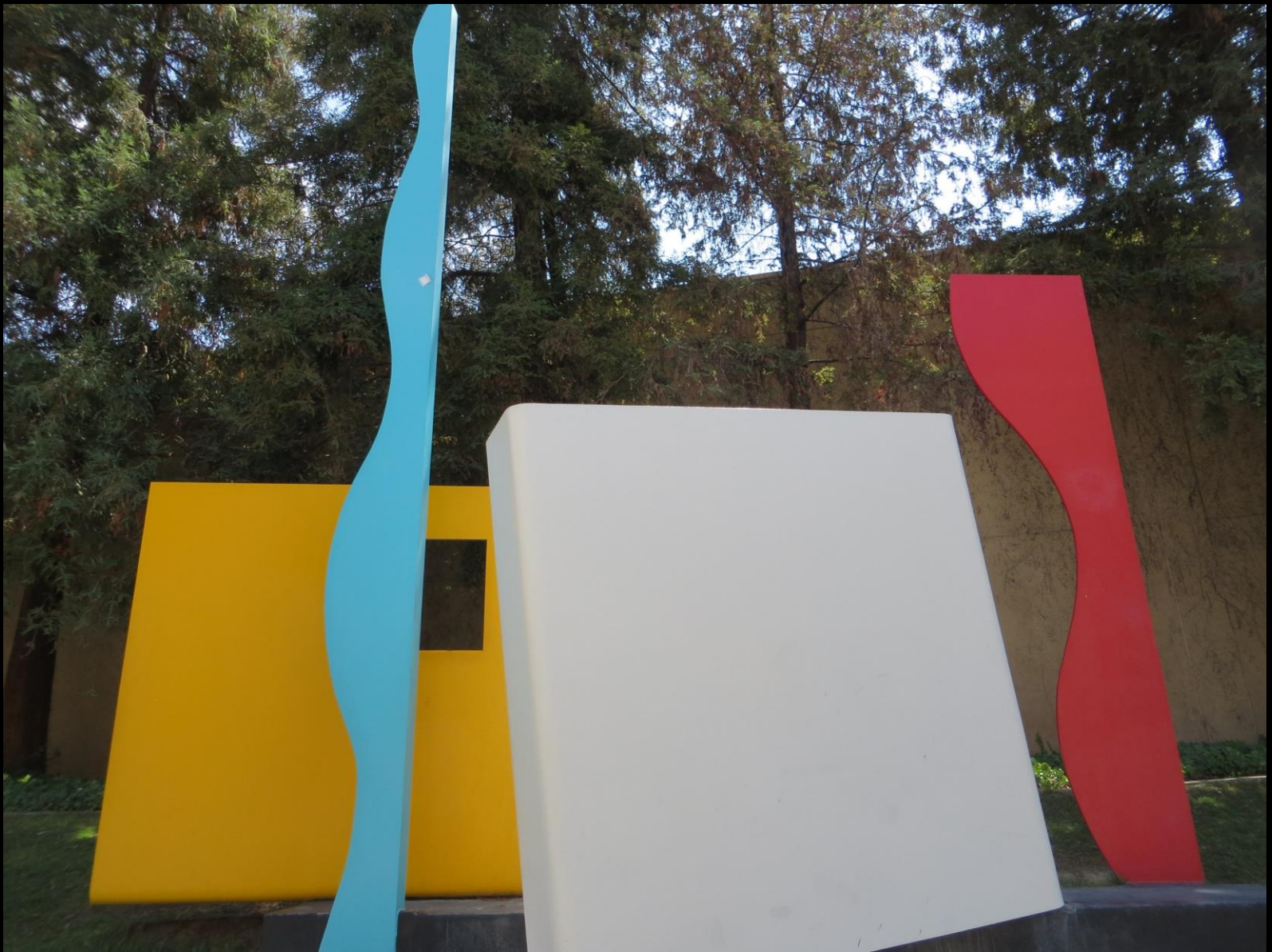
Civic Stage Set by David Bottini: Tech museum build out to require artwork be re-located or de-accessioned.