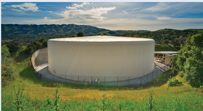
Toulon Pump Station and Reservoir, provides water to a portion of the Evergreen service area.

Drinking water, including bottled water, may reasonably be expected to contain at least small amounts of some contaminants. The presence of contaminants does not necessarily indicate that water poses a health risk. More information about contaminants and potential health effects can be obtained by calling the EPA's Safe Drinking Water Hotline at 800-426-4791.