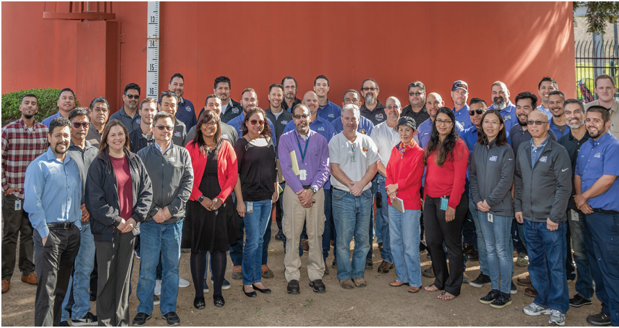
San José Municipal Water System staff.

For water-efficiency tips or to view the complete list of water use rules in effect at all times, please visit www.sjenvironment.org/waterefficiency .