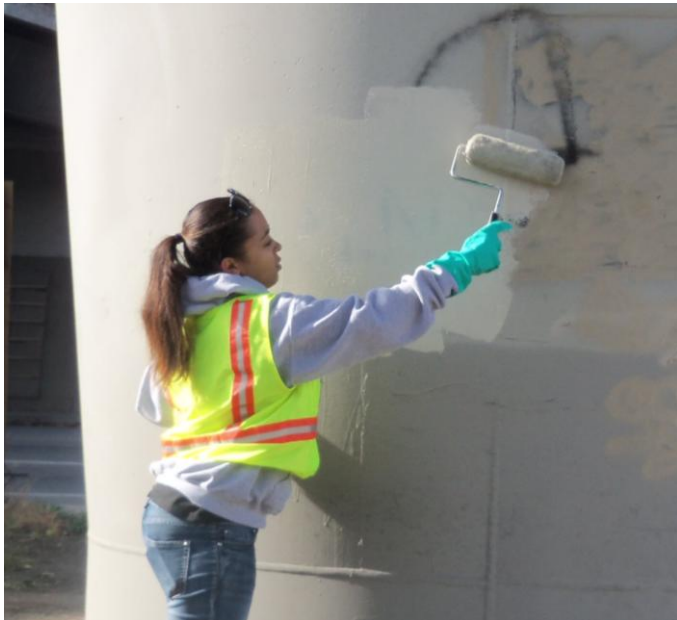
Graffiti removal on 7 th Street

The Anti-Graffiti and Anti-Litter Program has moved to Central Service Yard at 1661 Senter Road in Building G within the Spartan Keyes neighborhood. The ALP/AGT provides individuals and service groups