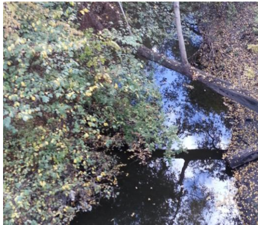
A clean Coyote Creek at William Street Bridge

Your efforts make a big difference in the cleanliness and health of Coyote Creek. After one year, Clean Creeks Healthy Communities along with volunteer support has improved the Urban Rapid Trash Assessment rating of Coyote Creek conditions, by an average of 23.5 points. Keep it up! Let's keep our watershed clean!