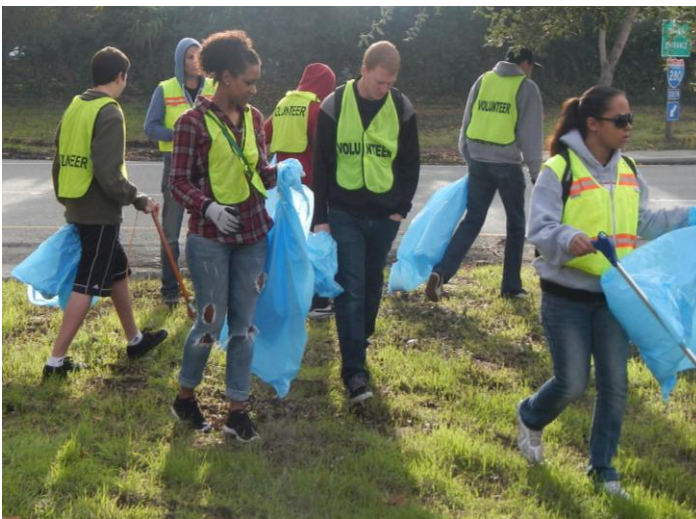
NeighborWalk volunteers clean up Spartan-Keyes

Spartan Keyes held a NeighborWalk, taking pride in the appearance of Spartan Keyes and preventing litter from entering the creek through the storm drain system. A total of 15 volunteers removed 4.6 cubic yards of trash. Great job!