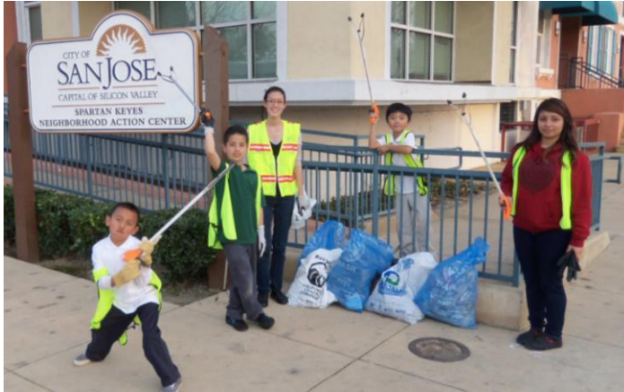
After school cleanup with Spartan Keys Community Center

Clean Creek Healthy Communities would like to thank all volunteers for helping to keep the Spartan Keys neighborhood clean.