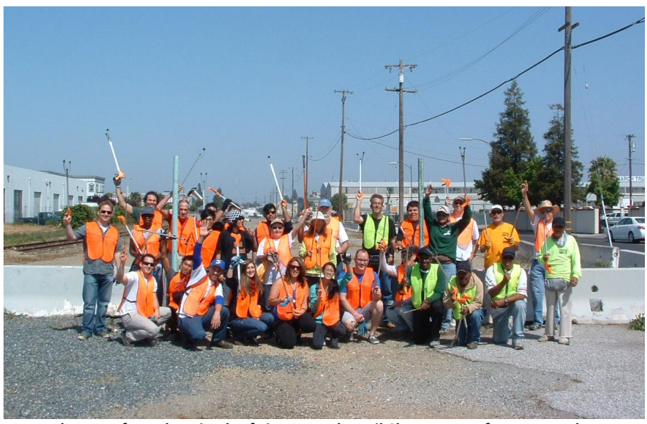
Volunteers from the Friends of Five Wounds Trail Cleanup pose for a group photo