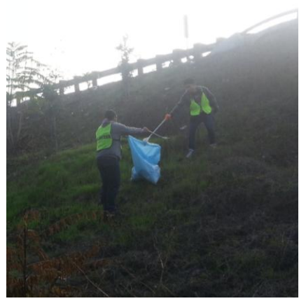
Volunteers from the last NeighborWalk clean near HWY 280

Take a stroll with your neighbors around your block and keep your community safe, clean, and healthy. Start a NeighborWalk!