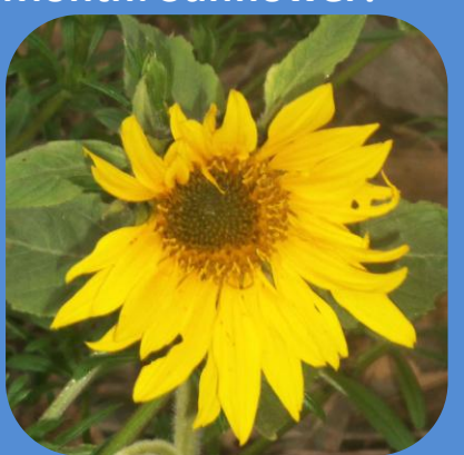
Click above to see more pictures on the CCHC Flickr page!