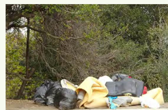
"Illegal dumpsites like these may contain hazardous materials that are harmful to the environment."

Report illegal dumping of furniture, shopping carts, and mattresses to the Department of Transportation. Call 1.408.794.1900 or use the San José Clean Mobile Phone App on iPhone and Android.