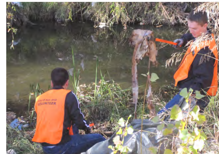
"Volunteers remove trash out of Coyote Creek"

Coyote Creek doesn't get as much love as it deserves. Originating from the Diablo Range just northeast of Morgan Hill, Coyote Creek flows northwest for about 42 miles through Morgan Hill and urban San José where it empties into the Lower South San Francisco Bay Area in Alviso.