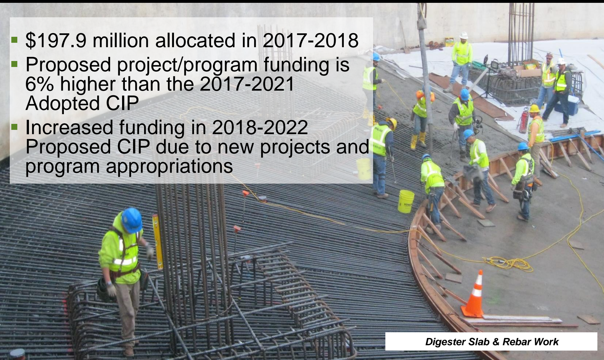
Digester Slab & Rebar Work