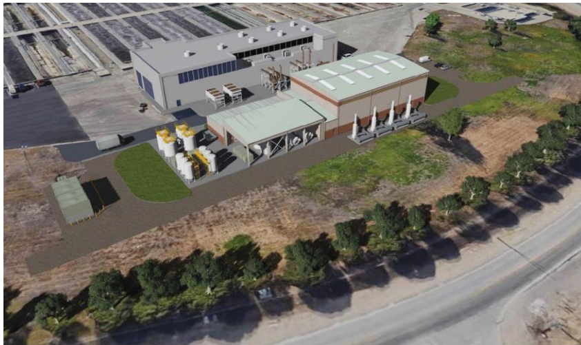
Conceptual rendering of new Cogeneration Facility