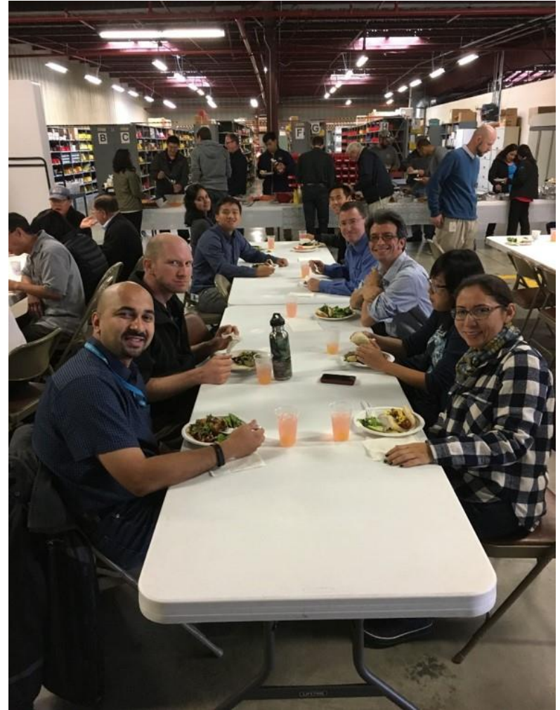
October 2016 CIP BBQ inside RWF warehouse