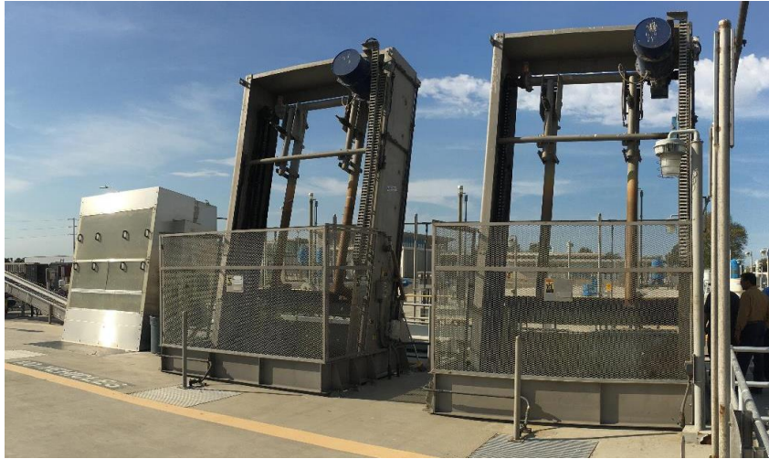
Headworks climber screens that will be replaced