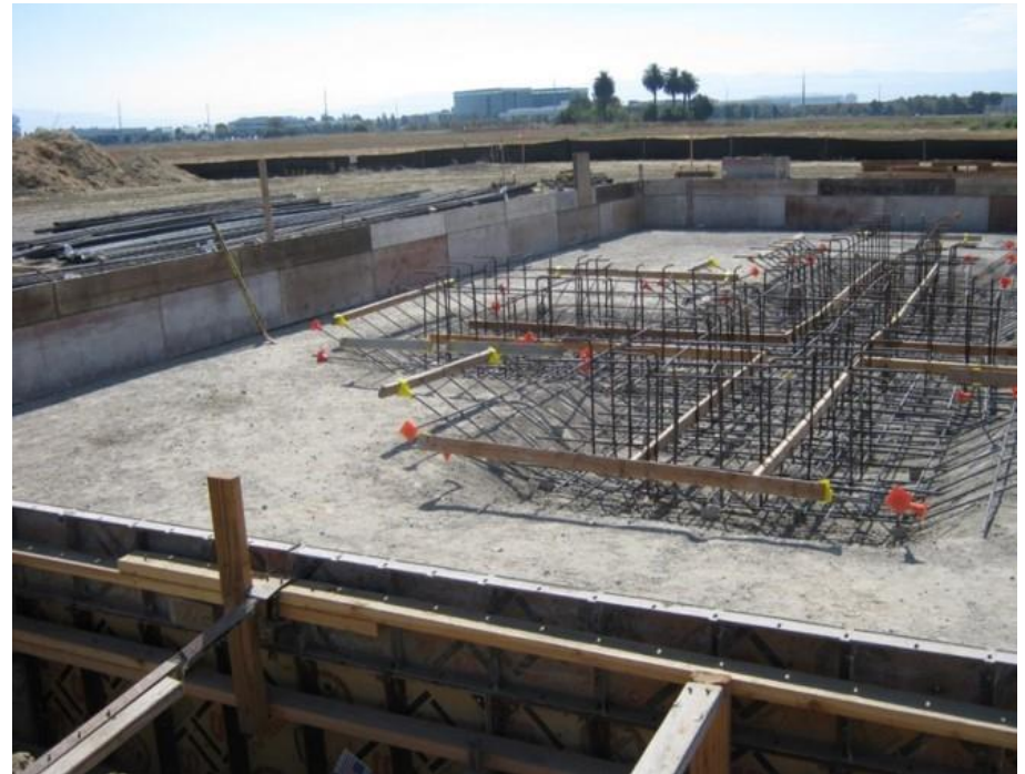
Formwork for a foundation in the Iron Salt Feed Station Project