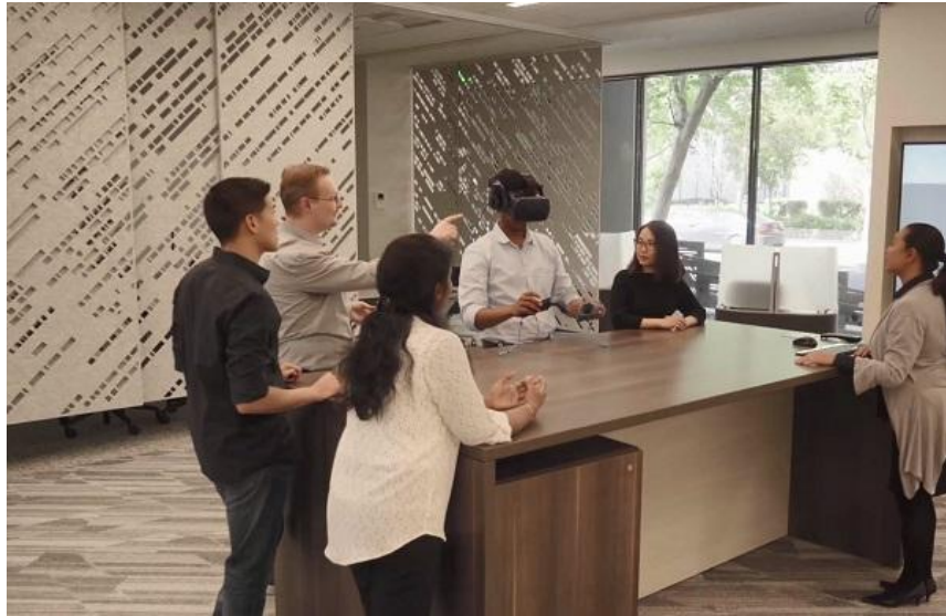
Demonstration of augmented reality technology at the Rockwell Automation facility in San Jose