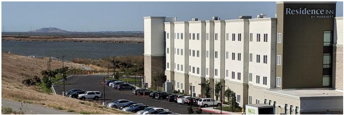
New Residence Inn in San Jose, with its view of the Bay

Two new Marriott properties are now open in North San Jose's Alviso area - Residence Inn and Fairfield Inn & Suites. Located at 656 America Center Court, the facilities represent an added 261 rooms to San Jose's hotel-hungry landscape.