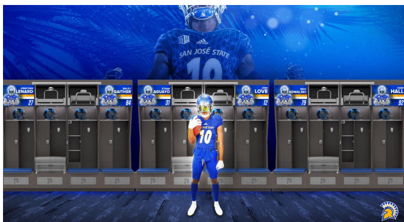
Graphic of locker layout in Spartans Athletic Center

Sounds and will be impressive. When construction concludes in 2023, it will house locker rooms for football and soccer teams; a 150-seat auditorium; coaching offices; position-specific classrooms; stadium game-day suites; a general reception area, and shared-use dining hall; and a top-notch training room accessible to all student-athletes.