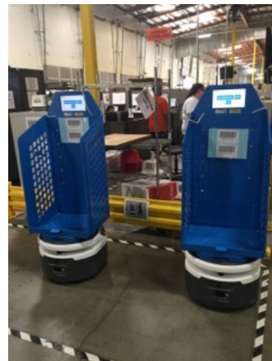
RK Logistics robots at work in the FTZ facility